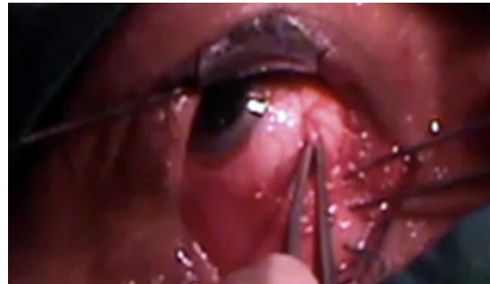
Figure 4: Atrophy of medial recti was found during exploration right eye surgery

During the evaluation, there was no restriction of medial recti muscle on Forced Duction Test. Atrophy of medial recti was found during exploration right eye surgery. The medication after surgery was topical antibiotic-antiinflammation.