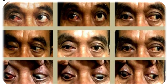
Figure 5: Ocular movements after vertical muscle transposition procedure

Two months after surgery, the double vision was decreased, the result of the Hirschberg test was XT 30° and Krimsky test 65°ΔBI.