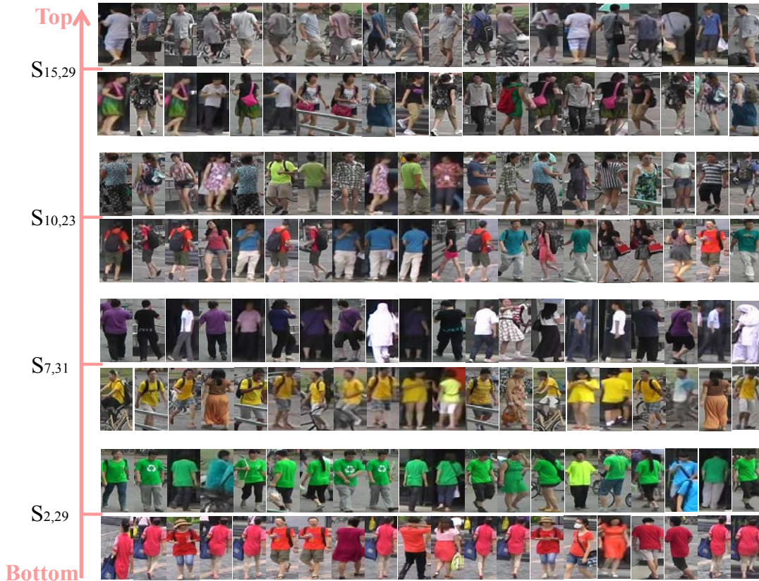
Figure 3. Four groups of images corresponding to highest (first row) and lowest (second row) values of four FSM outputs S_{n,i} , from bottom to top level respectively. Best viewed in colour.