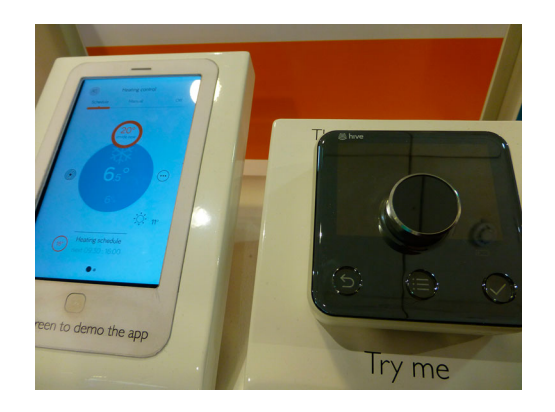
Figure 3. Example of smart heating controls.

Fieldwork for this paper was conducted in 2013, when smart heating controls were far less prevalent than they are now; however, they did sometimes feature in heating installers' conversations. Amidst promises regarding their ease of use, flexible operating options, and energy saving potential, smart heating controls are currently receiving significant attention from the heating industry and policy-makers (DECC, n.d.). However, achieving their promised benefits will be influenced by the way in which these products come to be in the home. These devices, illustrated in Figure 3, usually include a digital user interface (a touchscreen, for example) and