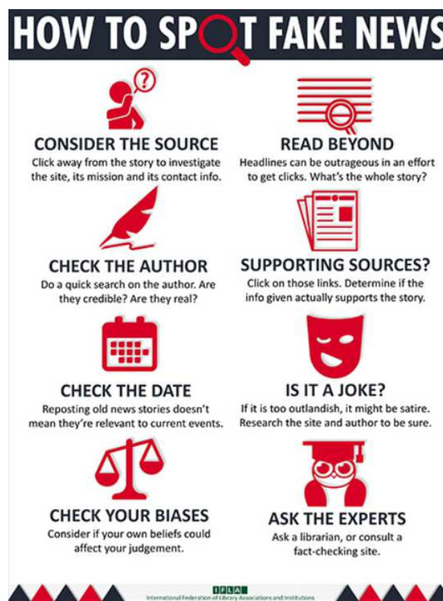
Figure 2: How to spot fake news.

Source: International Federation of Library Associations and Institutions. 10