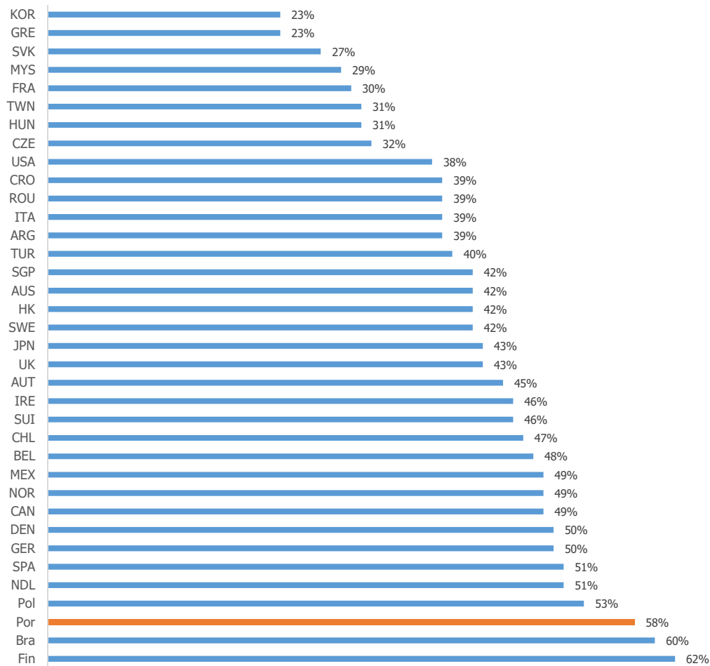
Figure 3: Global trust in the news media, by country in the study (ascending order).