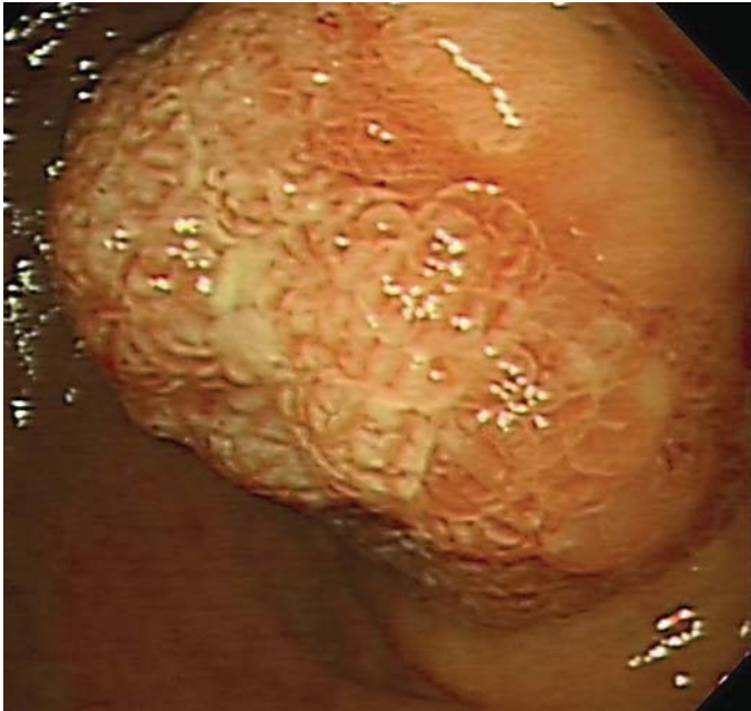
Fig. 1. Endoscopic appearance of the polyp arising from D1, demonstrating the ulcerated surface and a broad base.