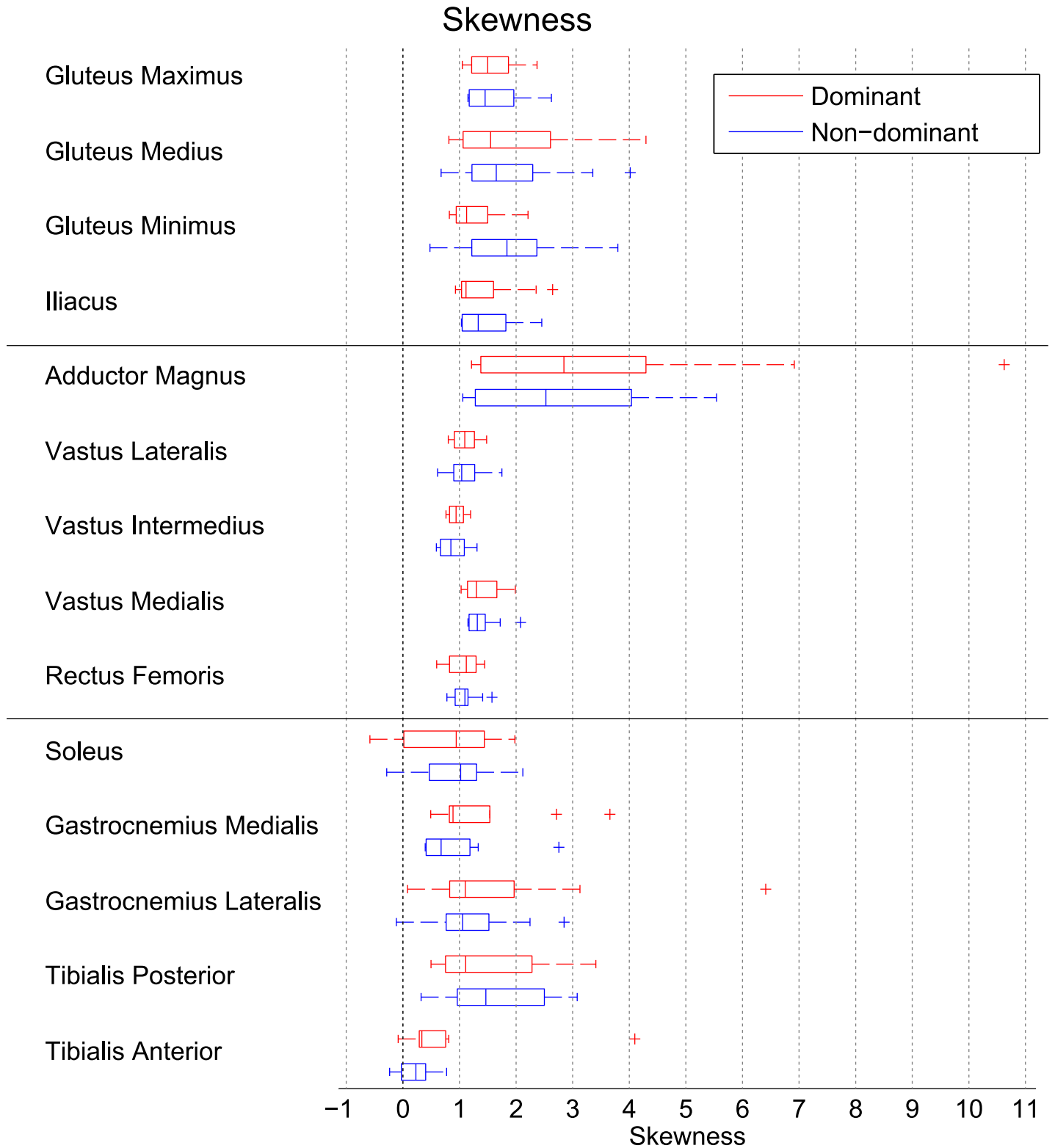
Fig 2. Skewness of the FDG uptake distribution in the muscles in the dominant and the non-dominant lower limb. A skewness of zero would indicate a normal, Gaussian distribution, whereas higher skewness values such as observed in the Fig indicate that the most frequently occurring FDG uptake values clustered at the lower end of the distribution and the tail pointed towards the higher scores. On each box, the central mark is the median, the edges of the box are the 25th (q1) and 75th (q3) percentiles, the whiskers extend to the most extreme data points not considered outliers, and outliers are plotted individually. Points are drawn as outliers if they are larger than q3 + 1.5 \cdot (q3 - q1) or smaller than q1 - 1.5 \cdot (q3 - q1) .

https://doi.org/10.1371/journal.pone.0215276.g002