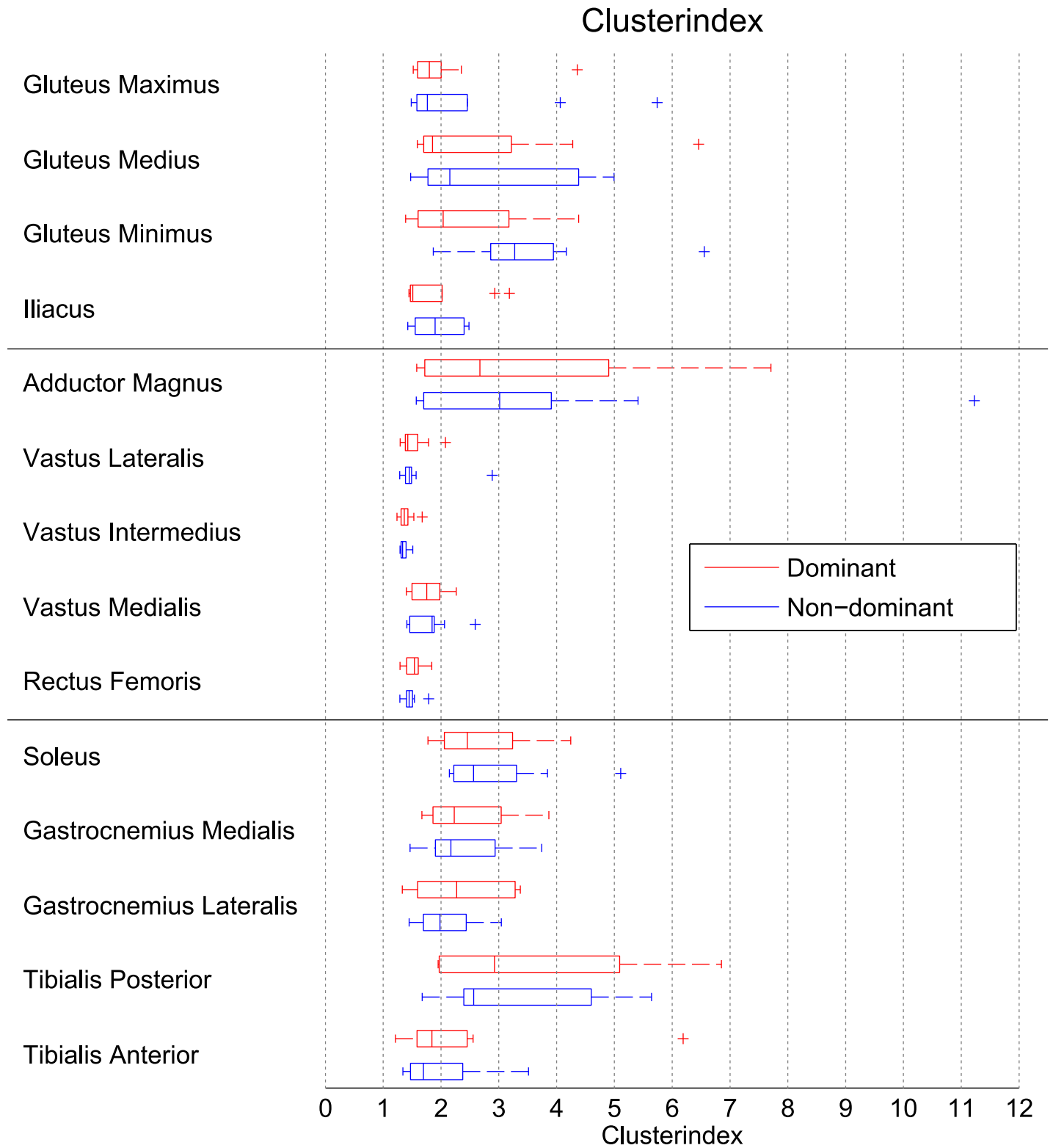
Fig 4. Cluster indices per muscle. A cluster index of zero would indicate a homogeneous distribution of the 'hot' voxels of FDG across the muscle, whereas higher values are indicative of a clustering effect. On each box, the central mark is the median, the edges of the box are the 25th (q1) and 75th (q3) percentiles, the whiskers extend to the most extreme data points not considered outliers, and outliers are plotted individually. Points are drawn as outliers if they are larger than q3 + 1.5 \cdot (q3 - q1) or smaller than q1 - 1.5 \cdot (q3 - q1) .

https://doi.org/10.1371/journal.pone.0215276.g004