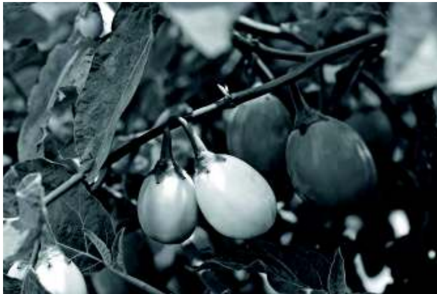
Figure C6.1 African eggplant: In the process of domestication, Solanum aethiopicum L. developed into four cultivated groups based on adaptation to different growing conditions and selection for either fruit or leaf consumption. The Gilo group, shown here, has edible oval or round fruit 2–12 cm long ranging in colour from white, green, red, brown to purple. The Shum group has small hairless leaves, which are consumed as a leafy green; the small, very bitter fruit is not eaten. The Kumba group produces large ridged fruit (5–10 cm in diameter) edible when green or red in colour, and has large leaves that can be consumed as a vegetable; some cultivars of this group are used for both fruit and leaf consumption, while others are mainly grown as leafy vegetables. The furrowed fruit of the Acelatum group is about 3–8 cm in diameter (Grubben and Denton, 2004; Porcher, 2010).

and tomato are reasonably well understood and may be regarded as ‘model’ species for research, the majority of the potential vegetable species within the genus remain largely under-researched, if not undiscovered. In the case of the ‘aubergine’ or eggplant ( Solanum melongena ), its worldwide prominence in Mediterranean agricultural environments has led to a long history of cultivation and substantive research support, mostly for purple coloured teardrop shapes or their near equivalent. This is less true for other shapes and colours of S. melongena . Three of its near relatives, the African eggplants ( S. aethiopicum , S. anguivi , and S. macrocarpon ) have received very little research attention, yet these species have potential for helping smallholder farmers grow themselves out of poverty.