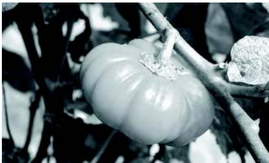
Figure C6.2 An African eggplant of the Kumba group. African eggplant fruit is eaten boiled, steamed, pickled or in stews with other vegetables and meats. Young leaves of African eggplant are high in beta-carotene and calcium.