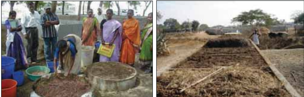
Fig. 1. Vermicompost preparation in rings. Fig. 2. Vermicompost tank.