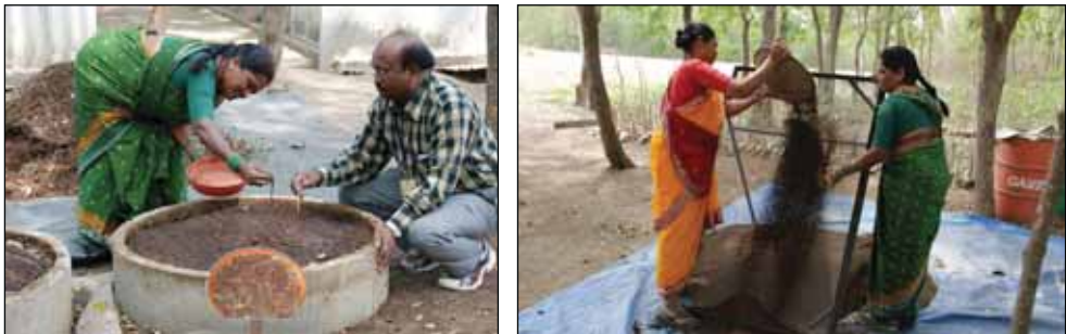
Fig. 3. Releasing earthworms.