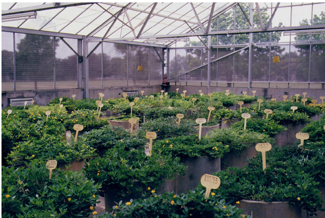
Figure 2. Wild Arachis accessions grown under Arachis House at ICRISAT, Patancheru, India