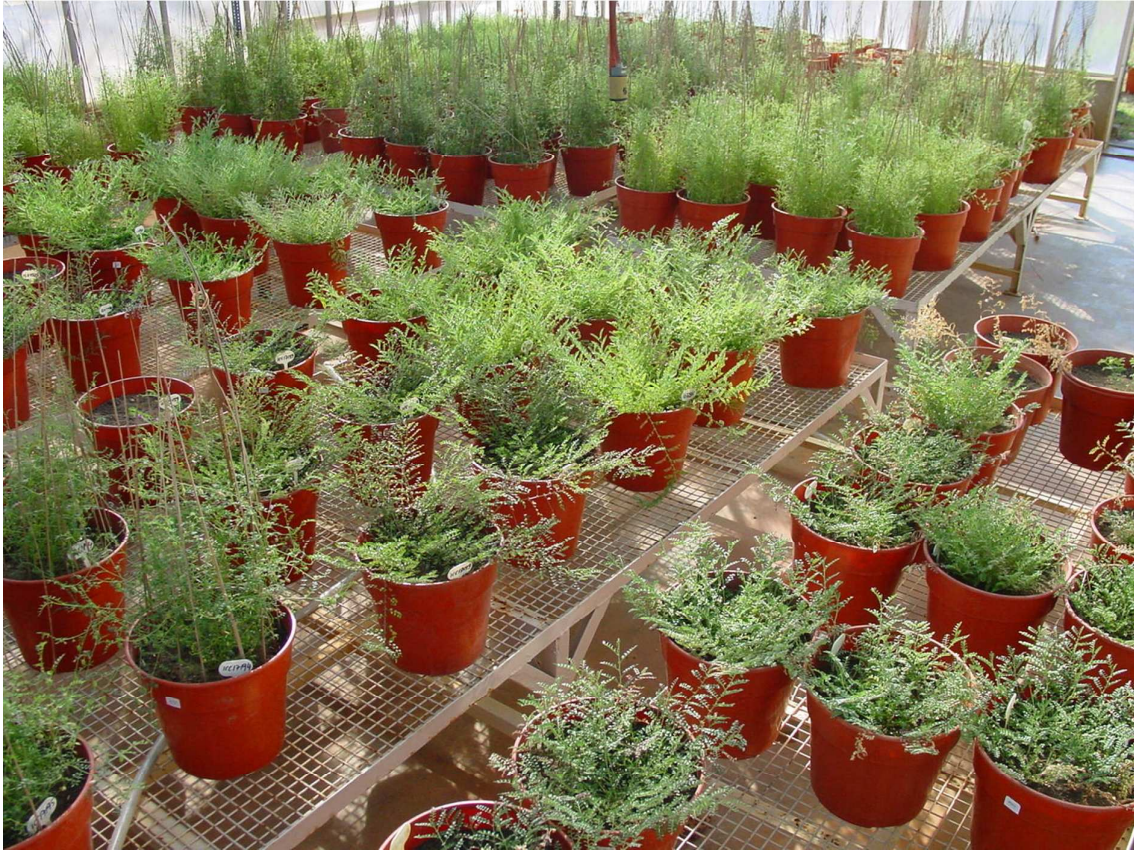
Figure 3. Wild chickpea accessions grown under controlled green house conditions at ICRISAT, Patancheru, India