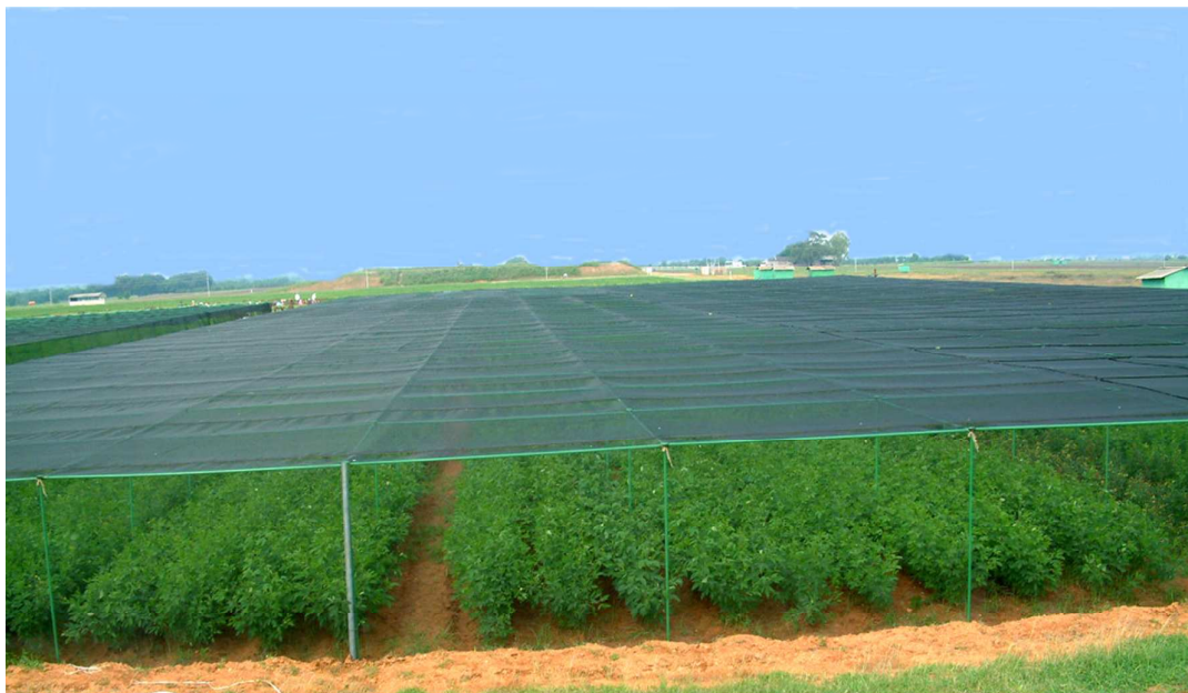
Figure 1. Pigeonpea germplasm accessions grown under insect-proof cages at ICRISAT, Patancheru, India