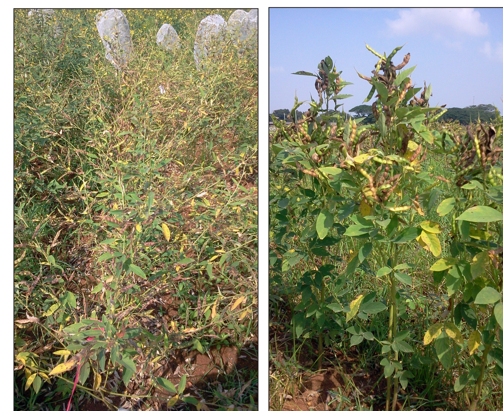
Super-early pigeonpea non-determinate (left) and determinate (right) lines at podding stage (ICRISAT, Andhra Pradesh, India)

Several of the newly developed super-early pigeonpea DT and NDT lines represent options for the cereal-legume cropping system and could also allow expansion of the traditional pigeonpea growing areas to wider latitudes and altitudes. Further testing is necessary to confirm performance over time.