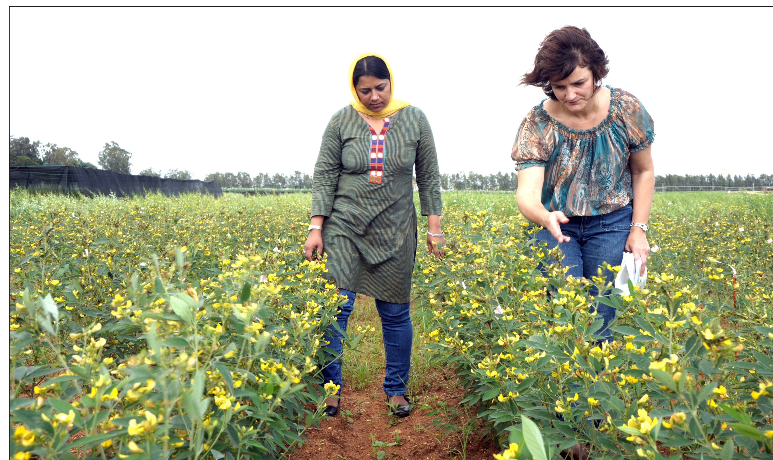
Super-early pigeonpea lines at flowering stage (ICRISAT, Andhra Pradesh, India)