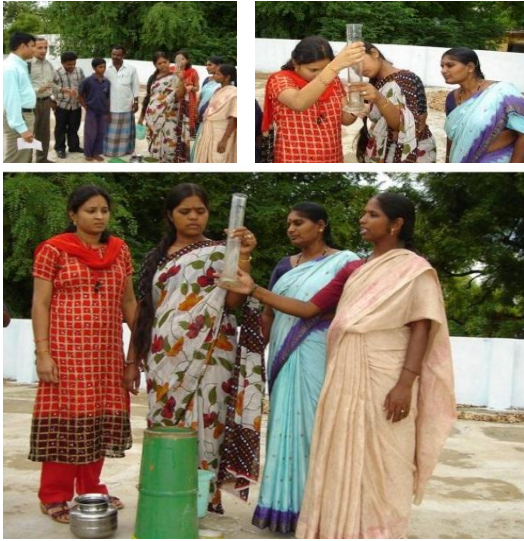
Fig 2: Women volunteers are able to play information facilitation functions, critical in information management for farming.

ICRISAT scholars in Addakal, south central India, observed that the time-to satisfactory response from experts declined from about 6 days to less than 24 hours, going down to as low as 8 hours, where trained intermediaries were available. There is a noticeable difference in information facilitation capability before and after training. The trained women volunteers (Figure 2) were able to refine farmers queries before passing them on to the experts; and were able to fine tune answers from the experts before passing them on to the farmers (Dileepkumar et al., 2005).