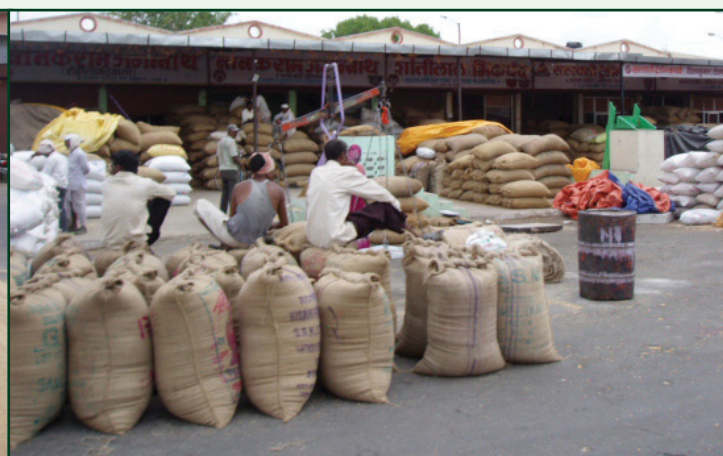
Market Yard, Beed Market, HOPE cluster, Maharashtra.