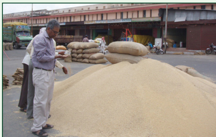
Rabi sorghum grain to be auctioned at Pune Market, HOPE cluster, Maharashtra.

After harvest, the bulk of the grain is retained for home consumption and the rest sold in regulated markets