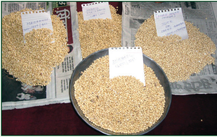
Rabi sorghum grain graded by variety and quality, Barsi Market, HOPE Cluster, Maharashtra.

and/or through village middlemen and unregulated markets. A part of the grain is used for payment in kind (wages), and of the remaining, a small quantity is retained for seed. The marketed surplus of post-rainy season sorghum varies by farm size; large farmers sell a larger portion of their grain (66%) than smallholder farmers (37%). For post-rainy season sorghum, on an average about 40-50% of the total production is sold in different channels and the rest is utilized for home consumption (survey findings of HOPE project, 2010). Although the regulated markets can be divided into primary, secondary and terminal markets, this is not fixed, and there are overlaps. For example, in practice, many markets have primary and secondary market functions, both of which are important. Typically, in