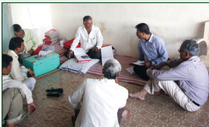
Discussion with rabi sorghum grain trader, Jalna Market, HOPE Cluster, Maharashtra.

The opportunity for farmers to realize higher prices for their produce, is to clean and grade the produce before bringing it to the market. The opportunity also lies in the form of procuring equipment for cleaning and grading, with minimum investment under the co-operative set-up, to process the produce before selling, either in the market, or directly to the demand centers.