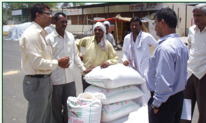
Discussion with commission agent on marketing practices, Jalna Market, HOPE Cluster, Maharashtra.

Typically in coarse cereals markets, smallholder farmers have been growing these commodities for home consumption and they market small surpluses in the food grain markets, either directly or through middlemen. Owing to small surpluses, the marketing and transaction costs are generally high. However, under the changing agricultural scenario, industrial processors demand bulk quantities of these grains. There is thus a need to group small-scale farmers into commodity groups and link them to industrial users. Industrial