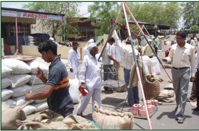
Rabi sorghum being weighed and traded, Lathur Market, HOPE Cluster, Maharashtra.

The advantages for the buyers include: Overcoming multiple transactions; assured supply of produce; overcoming seasonality in purchase to some extent (grain availability throughout the year); assured quality of the produce and origin.