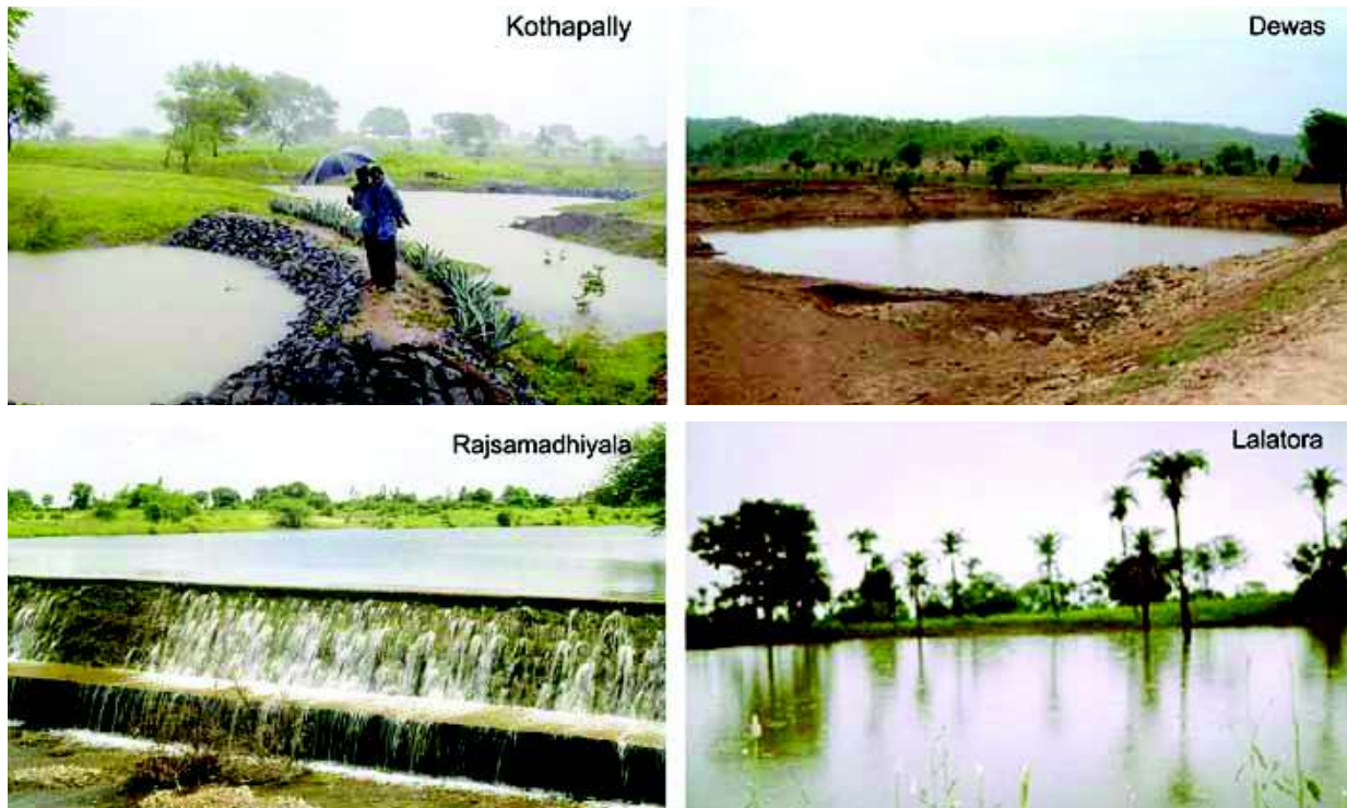
Low-cost rainwater harvesting structures

ments and use of bio-fertilizers resulted in 21-66 per cent increases in crop yields covering three million hectares in 30 districts.