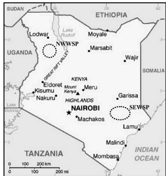
Fig. 1 Sampling sites (encircled) of the two wild sorghum populations: North-West wild sorghum population (NWWSP) and South-East wild sorghum population (SEWSP)

Eighteen unlinked microsatellite loci were employed to estimate allele frequencies and the level of heterozygosity in wild sorghum populations (Table 1). Forward primers were labelled with FAM, HEX, or TET,