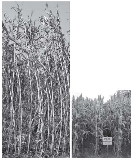
Fig. 1. Comparative view of high biomass sorghum line (IS 27206) and grain sorghum line (PVK 801)

The six high biomass sorghum lines were characterized in terms of candidate agronomic traits. The ANOVA revealed significant differences for the agronomic traits studied i.e. plant height (m), internode diameter (mm), number of internodes, fresh stalk yield (t ha -1 ) and stover yield (t ha -1 ) among the entries in the