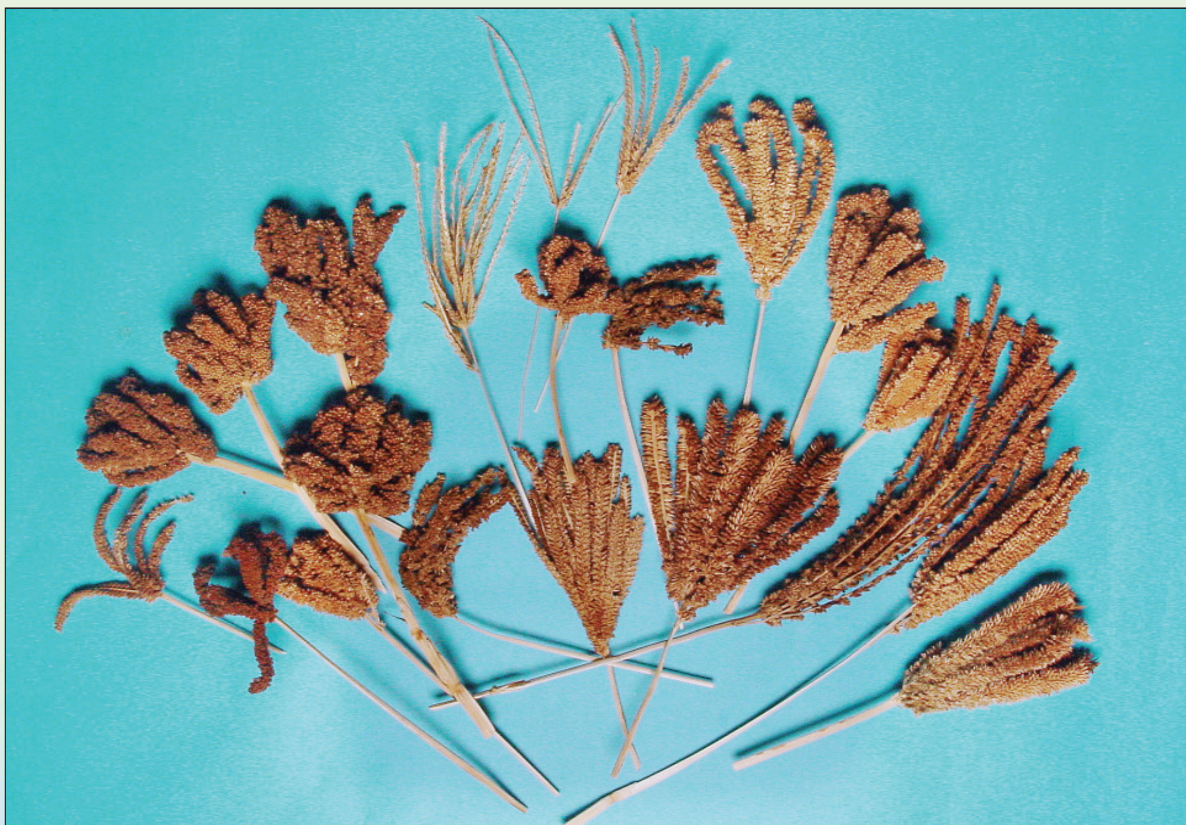
Diversity of spikes in finger millet germplasm.