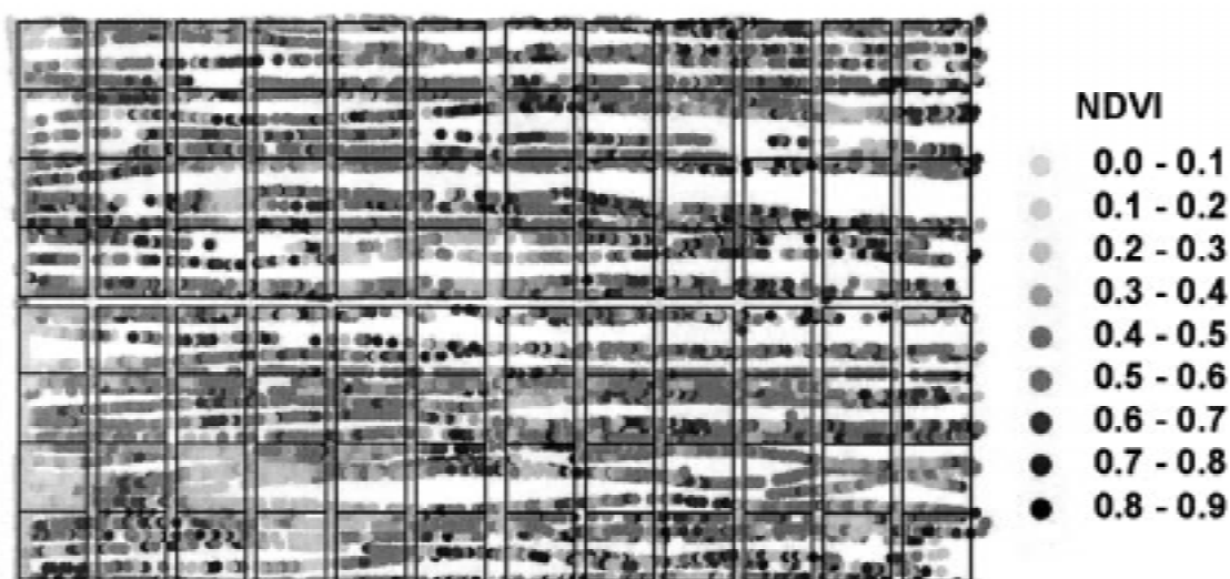
Figure 2. Punctual normalised difference vegetation index (NDVI) map obtained from radiometer measurements of the fallow vegetation on 24 August 1998.