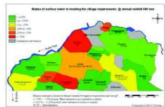
Annual rain fall 900 mm