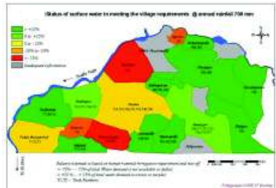
Annual rain fall 700 mm