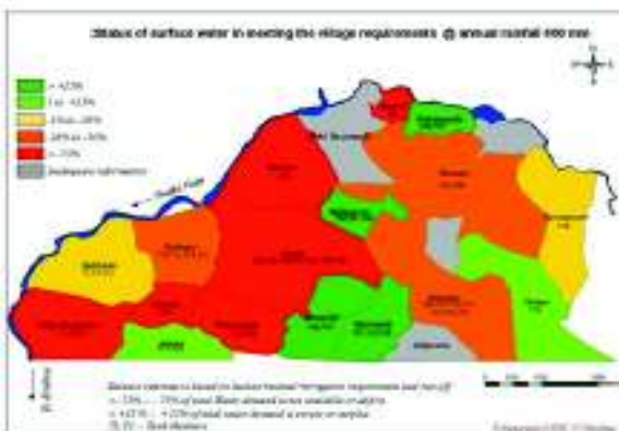
Annual rain fall 400 mm