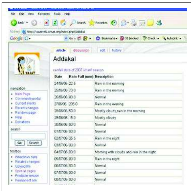
Figure 5: Rainfall data uploaded by rural volunteers on VASAT wiki @ http://vasatwiki.icrisat.org/index.php/Addakal

The data uploaded by the rural women volunteers was used to assess the usefulness of the rainfall prediction for the Addakal area. The results are presented in table 1.