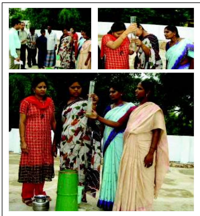
Figure 4: Rural volunteers trained in rainfall measurement

In June 2006, a rain gauge was installed in the AMS information hub. Four volunteers were trained in the measurement techniques and in maintaining the rain gauge (Fig 4). They were also trained in uploading the measured data to a wiki-site, which would retain date and time stamp whenever an update took place (Fig 5).