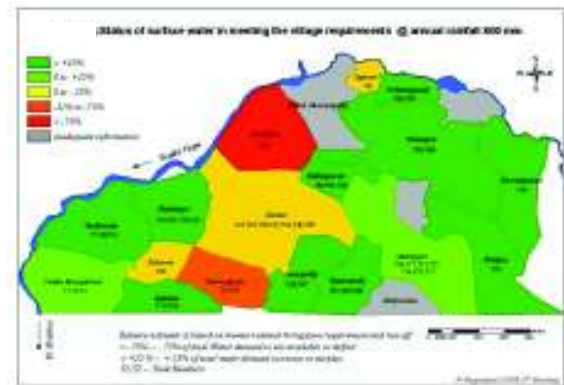
Annual rain fall 800 mm