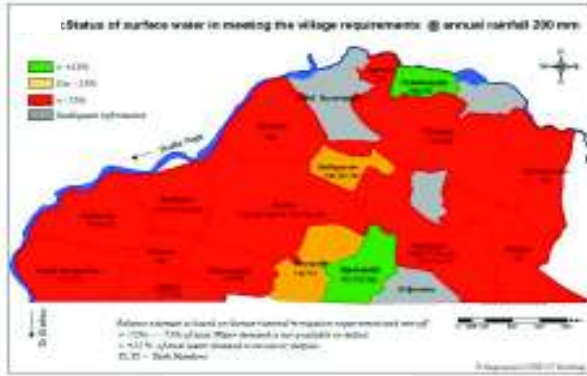
Annual rain fall 200 mm