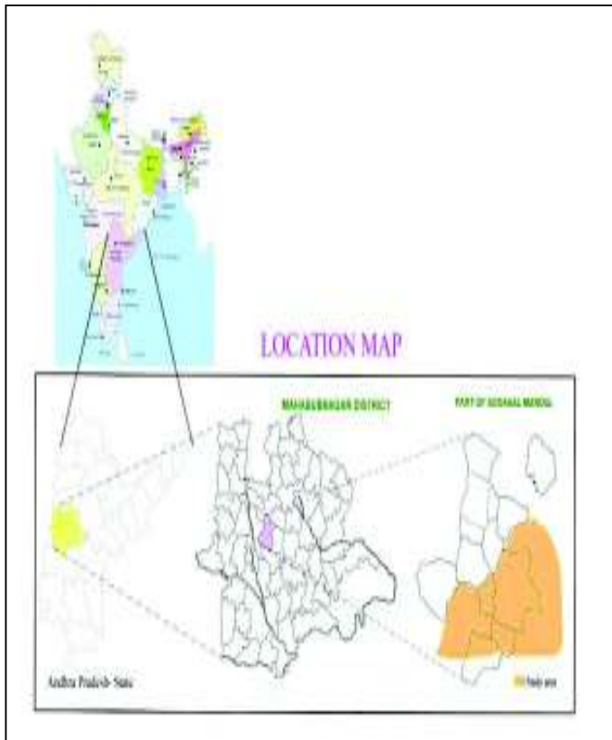
Figure 1: Addakal region in AP State, South Central India

According to the Censuses of India 2001, the population of this area is 46,380 (Male: 50.57%, Female: 49.43%) and the literacy rate is 35% (Male: 66%, Female: 34%), respectively. Over 75% workers are engaged in agriculture, dairy farming and allied activities. High risk associated with low investment capacity of farmers often results in higher rate of out migration, food insecurity and poverty. The main agriculture crops are castor, groundnut, maize, chickpea, pigeonpea, sorghum, pearl millet, paddy and orchard crops. This area consists of 8639 houses, 10 post offices, 998 telephone connections, 1 government hospital, 8 veterinary hospitals (one doctor is available for all the hospitals), 1 government junior college, 9 government high schools, 21 government elementary schools, 1 Anganvaadi Kendras (government baby care center), 10 dairies led by women, 1 library, and 3 banks including Adarsha Mahila Bank.