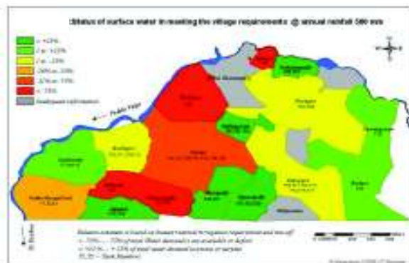
Annual rain fall 500 mm