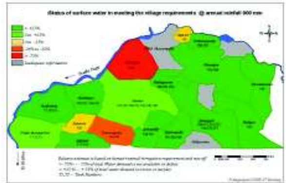
Annual rain fall 600 mm