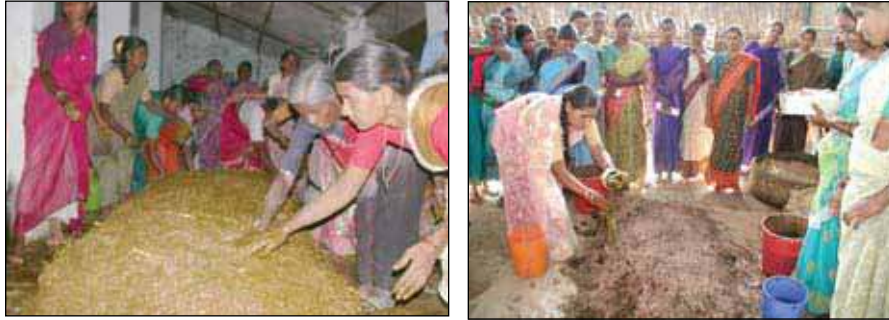
Figure 1. Farm women learning (vermicompost preparation).

(i) on the floor in a heap; (ii) in pits (up to 1 m depth); (iii) in an enclosure with a wall (1 m height) constructed with soil and rocks or brick material or cement; and (iv) in cement rings. The procedure for preparation of vermicompost is similar for all the methods (Figure 1).