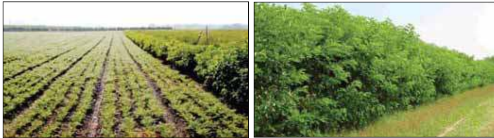
Figure 2. Glyricidia plants grown on border of chickpea field under rain-fed situation in India.