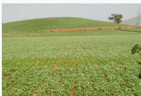
Groundnut crop after 30 days of moisture stress

Anantapur district lies in the rain shadow area of Andhra Pradesh, India. Despite frequent droughts, over 70% of Anantapur's cultivated area is sown to groundnut. During the last 12 years, there were only four 'good' rain years. The groundnut yield during these years averaged between 800 and 900 kg ha -1 and during 'drought' years between 300 and 400 kg ha -1 . Farmers persist in groundnut cultivation despite the State Government's initiative towards other dryland crops. They know that groundnut can withstand long dry spells much better than other crops and can revive itself even with a little rain after dry spells. Further, it gives valuable fodder even if it fails to produce pods.