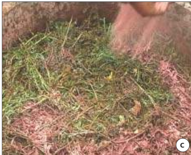
Rock phosphate powder sprinkled on organic material