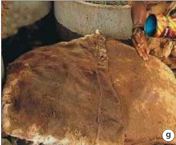
Cement ring covered with gunny bag