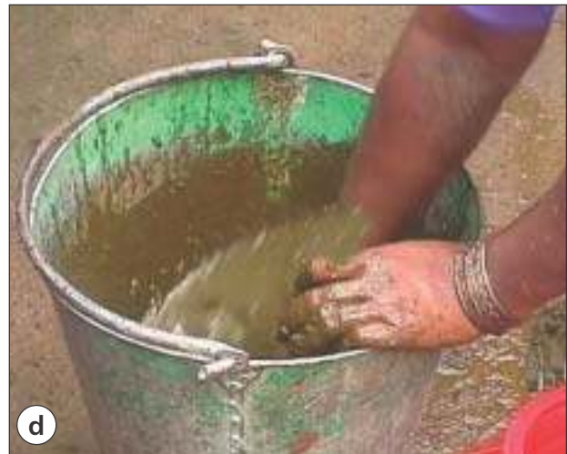
Cow dung slurry