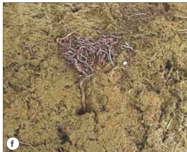
Earthworms are released near cracks