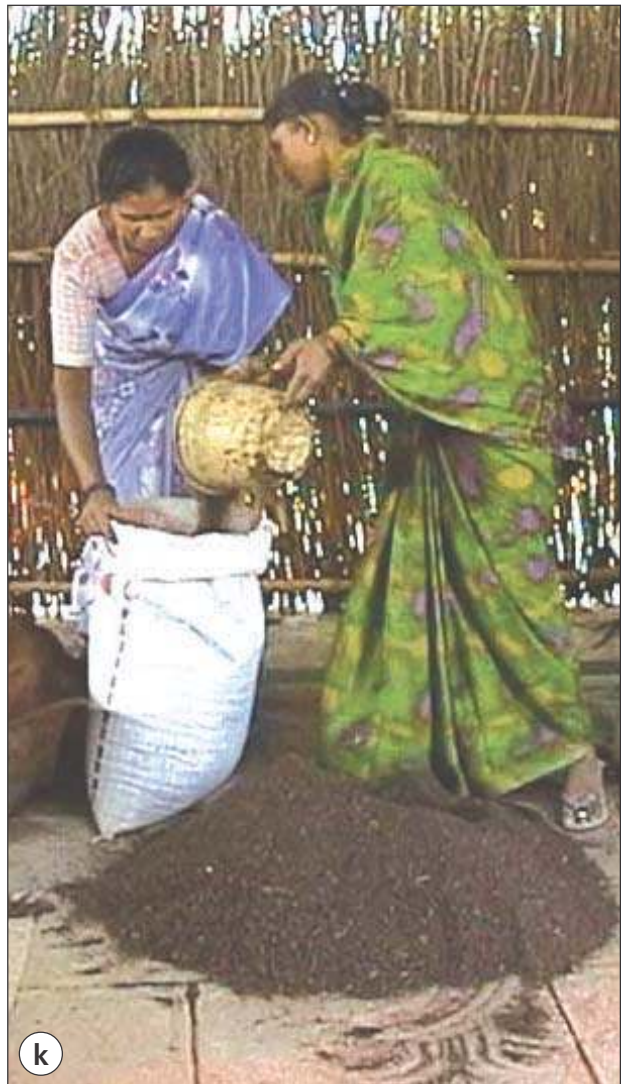
Bag filled with vermicompost