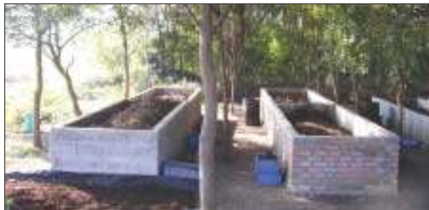
Figure 2. Commercial model for vermicomposting at ICRISAT.