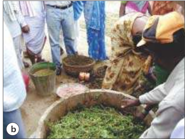
Layer of raw material placed on polythene sheet