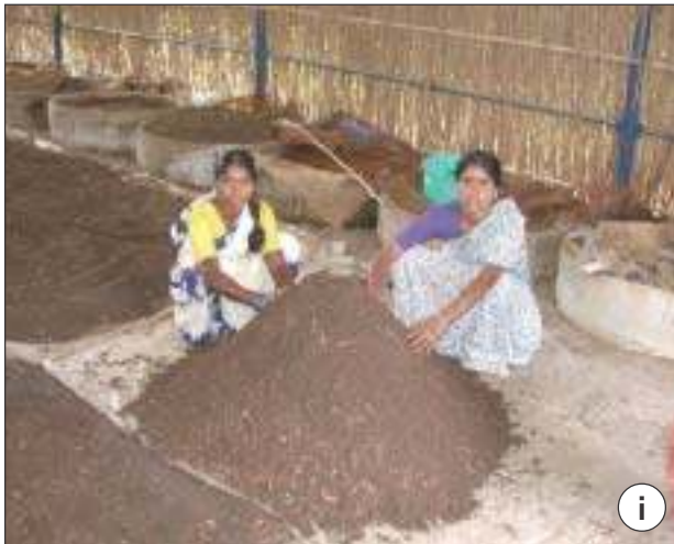
Heaping of vermicompost