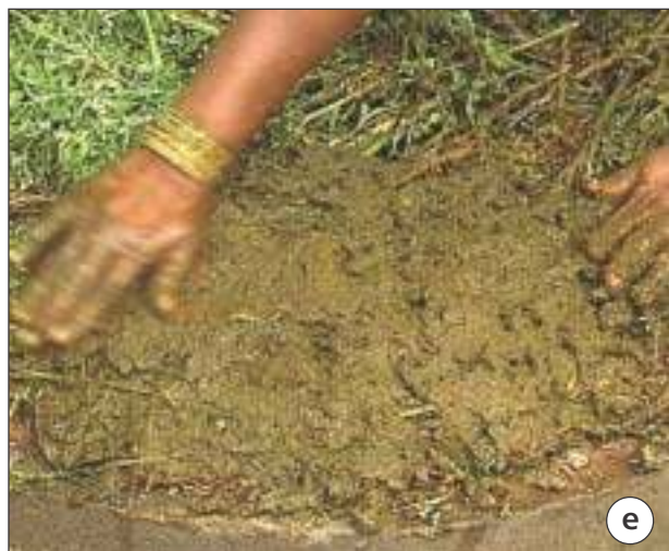
Cement ring sealed with cow dung