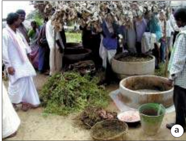
Plastic sheet placed below the ring