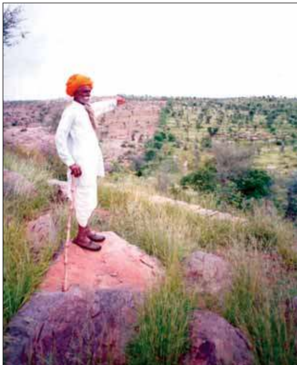
Figure 1. A villager showing the difference in vegetation on either side of the fence.

BAIF Institute of Rural Development, an NGO that is implementing the project here initially recognized the problem and engaged the community to discuss about what could be done to improve the situation. The people reciprocated positively and agreed to part with half of the common grazing area for rehabilitation. The village stakeholder community consisting of grazers, herders and farmers through panchayat , resolved to erect stone fence around the 45-ha grazing land and not allow any cattle to graze in that area. Thus the area was fortified with physical and social fencing. The stakeholders agreed to take up rehabilitation of the grazing land in half the area initially so that the other half was accessible to common grazing. Villagers contributed their labor to erect stone fencing, and construct soil and rainwater conservation structures to arrest runoff and increase infiltration. Over 200 staggered trenches, 290 percolation pits and 6 gully plugs were constructed across the grazing land. Once