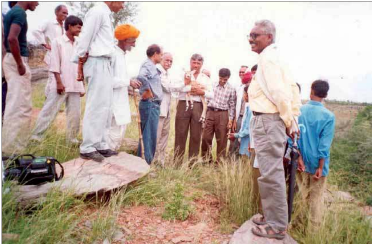
Figure 2. The PBA team with a blue bull calf.

The number of species of useful grasses and fodder has increased tremendously. Besides the flora, even the fauna was rehabilitated in this area. This area is a safe haven for nilgai [a species of wild cows (blue bulls)], adults and young ones. Rabbits, hares, jackals, foxes, mongooses and a host of bird species are found in this area. A biodiversity assessment was undertaken recently with the community participating actively in enumerating and listing the uses of the various herbs, shrubs and grasses that have been rehabilitated in this area (Fig. 2).