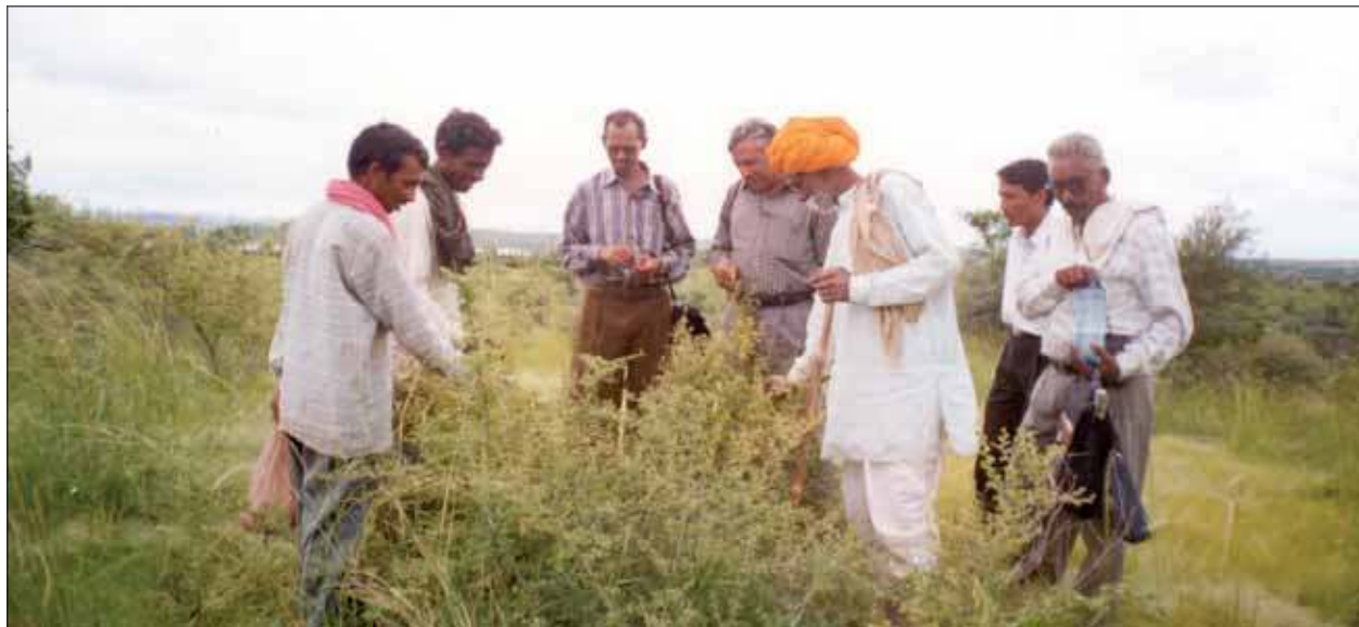
Figure 4. Villagers participating in PBA.

Once the farmers responded to the questionnaire, they were taken around the block assigned to the team (Fig. 4). The team spent over 4 hours going around the area, listing the names of herbs, shrubs and grasses and their uses. The details of the participatory survey are provided in Appendix 2. Besides this exercise, a group led by an ecologist carried out an independent assessment of the biodiversity assessment.