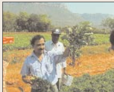
Promising drought-resistant genotypes.