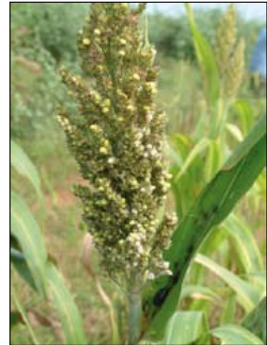
Figure 9. Creamy sticky liquid effected florets showing.

It is commonly known as sugary disease and its first symptom is the secretion of a creamy sticky liquid (honeydew) from the infected florets (Figure 9). When this honeydew is plenty, it results in blackening of ear head. If further favorable conditions prevail, long, straight or curved, cream to light brown colored sclerotia would develop.