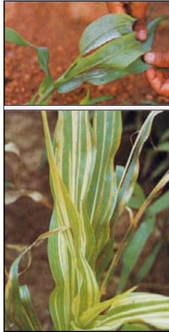
Figure 14. White stripes on the leaf and downy white growth on the lower surface.

Metalaxyl, ie, Ridomil 25 as seed dressing @ 1 g ai/kg or Apron 35SD@ 1 g ai/kg will control downy mildew. Satisfactory control can be achieved with 4 sprays of Dithane M45 (0.3%) at 7-day intervals beginning from germination.