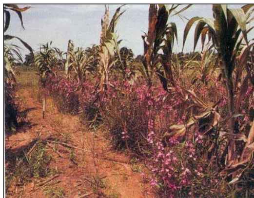
Figure 2. Crop infestation with Striga (pink-flowering plants).

By adapting crop rotation with trap crops, viz, cotton, sunflower and groundnut, the losses due to Striga in the long-run are minimized. For immediate results, hand pulling when Striga population is sparse or spraying of 2,4-D @ 2 kg ai/ha helps to reduce adverse effects.