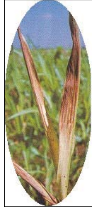
Figure 15. Leaf shredding symptom.