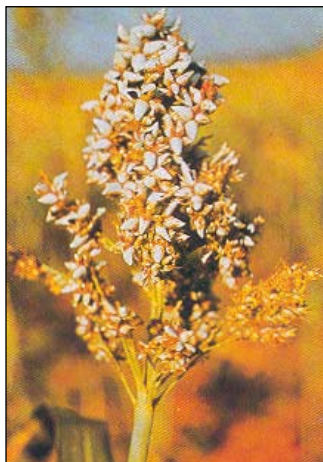
Figure 10. Covered kernel smut.

There are four types of smut: (a) covered kernel smut (Figure 10) – individual grains are replaced by smut; (b) loose kernel smut (Figure 11) – the infected plants flower prematurely and show increased tillering with loose ear head and infected florets; (c) long smut (Figure 12) – this is restricted to the