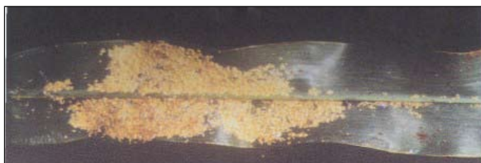
Figure 7. Ventral surface of leaf showing aphid colonies.

The corn leaf aphids are dark bluish-green. Female gives birth to young ones and a generation takes 7 days. The colonies are typically found deep inside the plant whorl of the middle leaf on the ventral surface of the leaves and panicle (Figure 7).