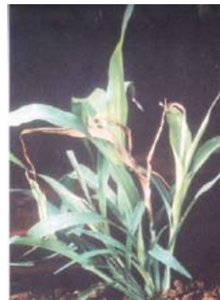
Figure 5. Seedlings showing drying of growing tips (dead hearts).

The adult is a small, grey fly which deposits small, white cigar shaped eggs, singly on the undersurface of the seedling leaves. After hatching in 2–3 days, the maggot enters the seedling through the whorl and destroys the growing point. The larval period lasts for 8–10 days. A mature larva is yellow and about 6 mm in length. Pupation takes place either at the plant base or in the soil and lasts for 8–10 days. The fly population exhibits considerable variation and is normally very low in April to June. It tends to increase in July and reaches the peak in August. From September onwards, the population gradually declines and remains at a moderate level until March.