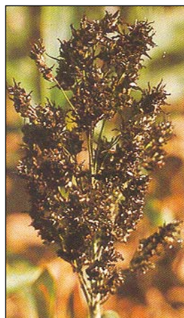
Figure 11. Loose kernel smut.