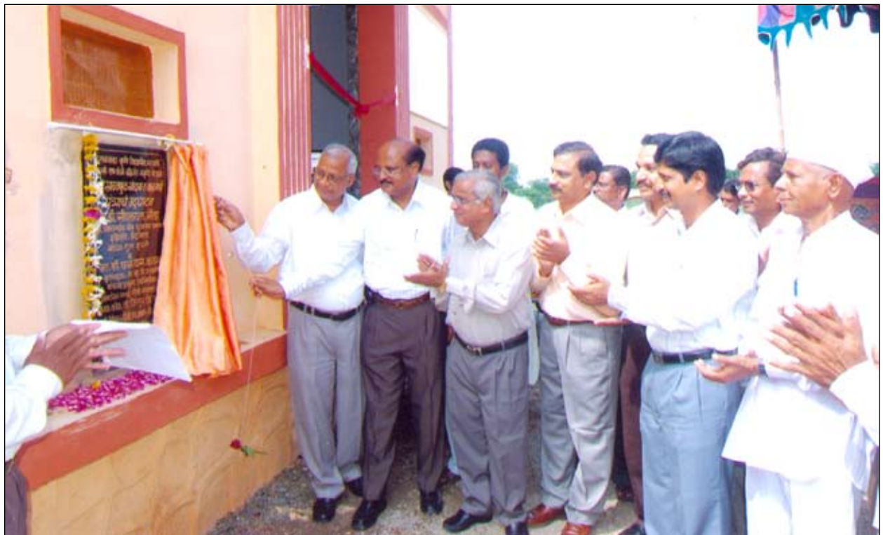
Inauguration of the storage structure in Maharashtra.