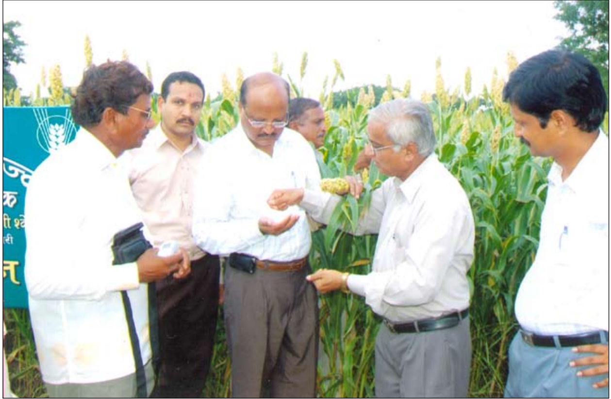
Field day in Maharashtra cluster.