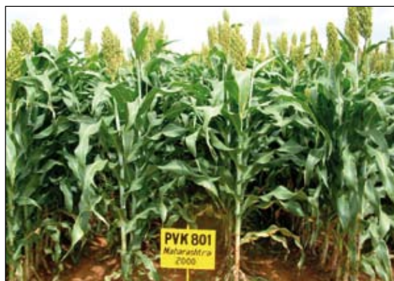
Figure 1. Sorghum crop showing row species.

The optimum plant population depends on different factors such as the available nutrients and moisture. The recommended optimum population is 1,80,000 plants per ha, which can be achieved by using 8 kg seed and planting in rows of 45 cm wide with a plant-to-plant distance of 12 cm (Figure 1). In case of dual-purpose cultivars (CSH 10, CSH 13, CSV 10, CSV 15), a plant population of 2.1 to 2.2 lakh/ha is recommended, which could be obtained by planting in rows of 45 cm wide with a plant-to-plant distance of 10 cm.