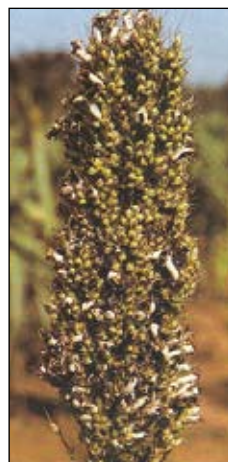
Figure 12. Long smut.