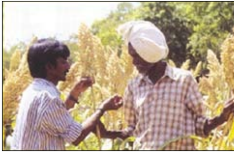
Figure 4. Educating farmer to identify physiological maturity; grain showing black discolorations at hilar end.