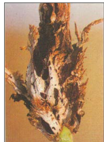
Figure 13. Head smut.