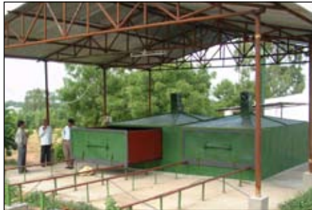
Figure 3. Sorghum ear head drier.