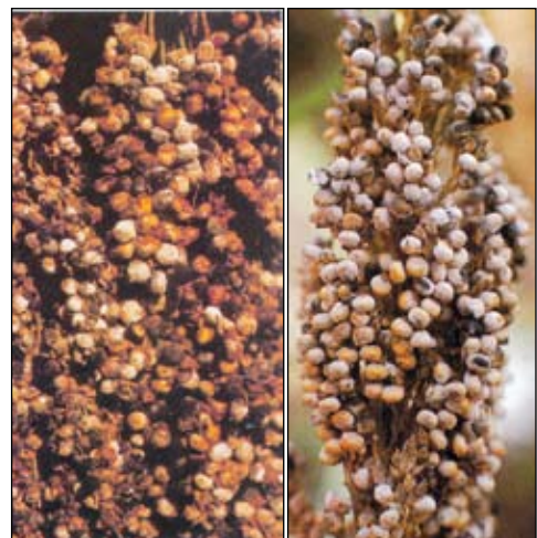
Figure 8. Grain mold affected earheads, seeds covered with black or white or pink fungal growth.

Grain molds occur if rains prevail during the flowering and grain filling stage. Thus molds are severe during the years of prolonged rainfall at the time of grain maturity. It results in the discoloration of grain (fluffy white or pinkish coloration), but the severity of infection results in black grains (Figure 8), which also reduces grain weight and size leading to considerable loss of yields even up to 100 percent. The grain mold infection reduces germination and acceptability of the harvested grain, nutritive value and market price.