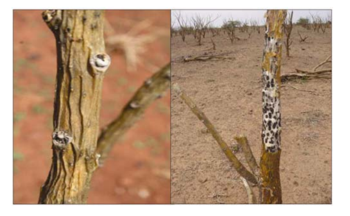
Figure 2. Shrivelled appearance of black rot-affected stem (left) and black lesions over the stem under the bark (right) caused by B. do-thidea .

For proving pathogenicity, the standard Koch's postulates process was adopted. Four centimetre long pieces of healthy stems were taken and the top epidermal layer was scraped using a scalpel and inoculated with 0.05–0.2 ml B. dothidea spore suspension ( 10^6 CFU/ml concentration) and tested for pathogenicity. The inoculated stems were covered with plastic bags and incubated at 25°C with a