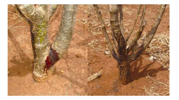
Figure 3. Exudation of reddish-brown gummy substance from the late infected stem (left) and discoloration of the affected stem (right) of J. curcas plants infected by B. dothidea .