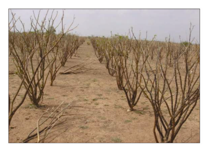
Figure 1. Severe mortality of Jatropha curcas occurred due to infection caused by Botryosphaeria dothidea in Rollapadu village, Kurnool District, Andhra Pradesh, India, in August 2009.