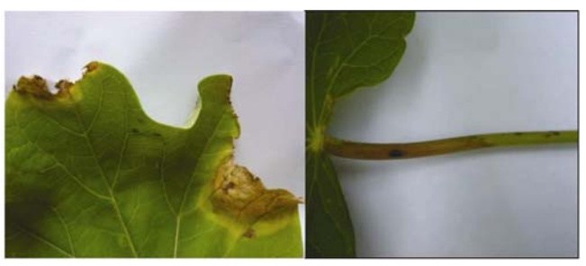
Figure 5. Developing light yellowish lesions in healthy leaves of Jatropha plant inoculated with spore suspension of B. dothidea after eight days of incubation.