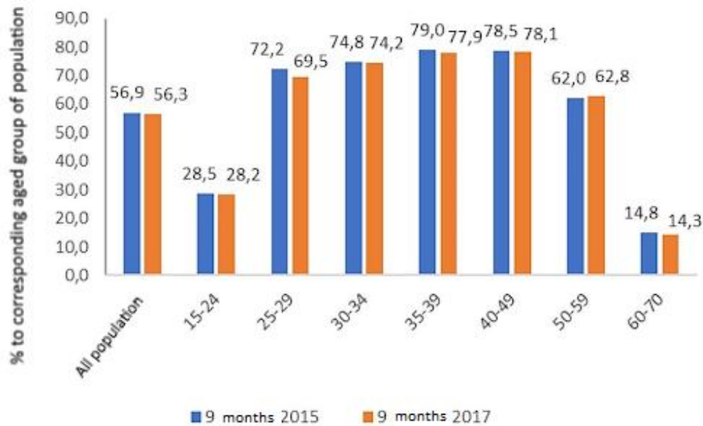
Picture 2. The population of the ILO by age groups in Ukraine during the 9 months of 2015-2017.

than 15% of the total unemployed population of Ukraine and 18.9% of the economically active population of the corresponding age (picture 2).