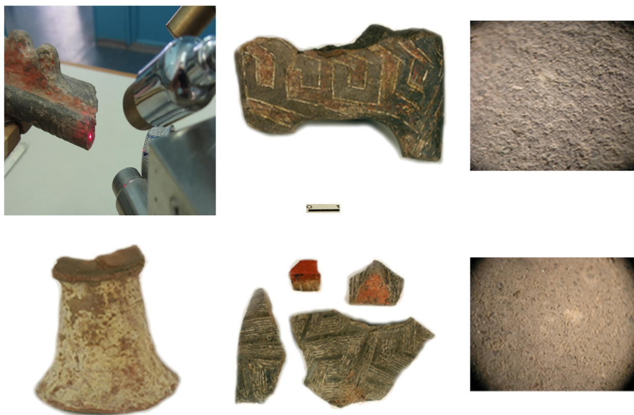
Figure 1 The pEDXRF equipment during the measurement, some representative ceramic fragments from the three archaeological sites and ceramic body OM picture.

explains 14.12% of the variance. The PC loadings indicate that Fe, Ti and K, dominate the first PC, respectively, while Mn and Ca are the most dominant parameters in the second PC. The scatter-plot of the first two PCs (Figure 2) represents three statistical groups. None of them is clearly separated along the PC