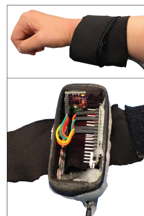
Figure 2: Top: the prototype attached to the inside of a hand. Bottom: inside of the prototype.

Software. The computer received the inertial data from the Arduino Nano and recorded the sound from the microphone. A program in Python applied a low-pass filter to the inertial data. The segmentation consisted of selecting an interval that represented a punch from the continuous stream of data coming from the inertial sensors and the audio from the microphone. We segmented the events by peak detection both for the inertial and the sound data. When a peak beyond a certain threshold was detected, 100ms before and 500ms after the peak were marked as an event. Figure 3 shows an