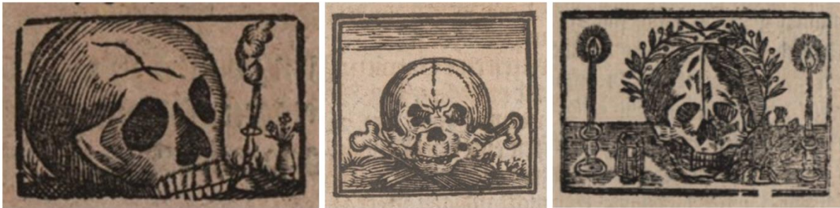
Figure 2: Skull Graphics (Details) from Viennese Execution Broadsides.

Courtesy of Vienna City Library. (C-39975/1754,3, p.4; C-39975/1744,1, p.1, C-39975/1939,2, p.4)