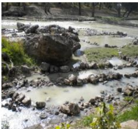
Fish trap

"Watering the environment maintains our cultural practices. For example, when there is water at the Fish Traps in Brewarrina our people gather there — old people, families and children — to swim, to catch fish and walk in the footsteps of ancestors at the traps. This is all a part of our cultural education which is about connectivity between all things in Country and our people. It is a holistic way of understanding waterways and all life. When there is water in the environment this way of understanding is clear to us".