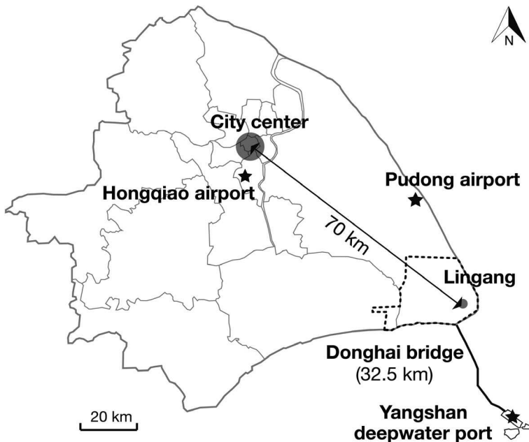
Figure 1: Lingang's location in Shanghai

Lingang new town was initiated in 2002 as part of Shanghai's masterplan to develop nine new towns in the suburban and peri-urban areas of the city (see Figure 1 for its location). Lingang covers an area of 315 km 2 and includes one new main residential town as well as four industrial zones (see Figure 2 for Lingang's land-use map). The main residential town of Lingang is called Nanhui main town and comprises an area of 67.76 km 2 , which has been entirely reclaimed from the sea. Apart from the main town, Lingang also has four industrial zones with a combined size of 241 km 2 , including the main industrial zone, the heavy-equipment manufacturing zone, Fengxian industrial zone and the comprehensive zone. So far, the most built-up area is the heavy-equipment manufacturing area developed by the SODC called Lingang Group, whilst the remaining industrial zones are still largely undeveloped. Lingang new town is currently governed by the LDMC, which is a state organisation directly governed by the Shanghai municipality.