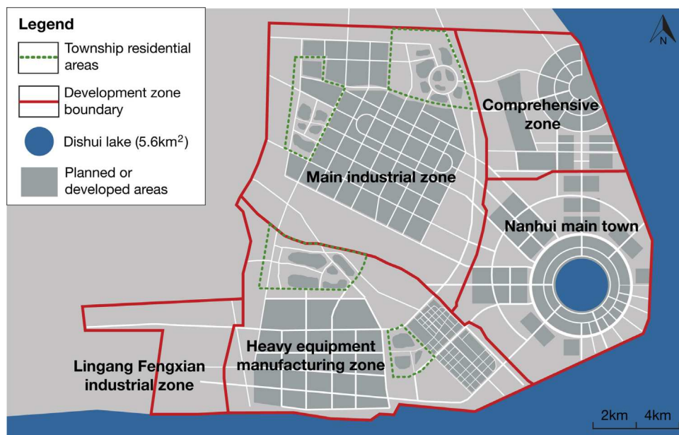
Figure 2: Land use map of Lingang [Colour figure can be viewed at wileyonlinelibrary.com ]