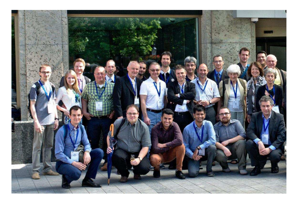
Figure 1: Delegates in Bratislava at IFAC ACE in 2016.

In terms of the core activities, the members of the two committees have an enthusiasm to ensure that control education retains a high profile in the control community, as it impacts on nearly all of us. The obvious mechanism is dedicated education sessions at the major conferences such as the annual American Control Conference, the Conference on Decision and Control, European Control Conference and the triennial IFAC world congress, as well as of course at a number of smaller conferences as the opportunities arise. Moreover, the committees have prime responsibility for the organisation of the triennial IFAC Symposium on Advances in Control Education (<a href="https://ifac-ace2019.org/">https://ifac-ace2019.org/</a>); this year in parallel with ACC in Philadelphia.