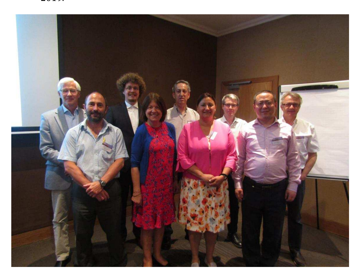
Figure 2: Delegates from the panel session at the PID event in Ghent, May 2018.

Current discussions include the planning of a demonstrator session at the world congress in Berlin 2020 (https://www.ifac2020.org/) and we encourage all readers to consider what they could showcase to their colleagues to help us all improve our practice.