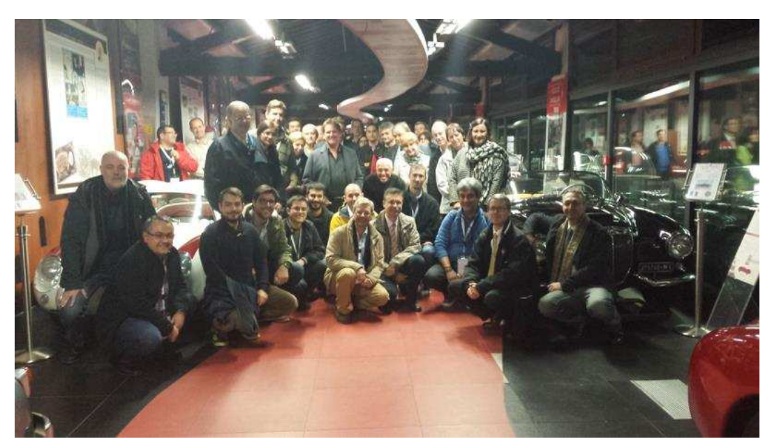
Figure 3: Delegates in Brescia at IFAC IBCE in 2015.

play a core role in adding high quality education and dissemination resources to this repository.