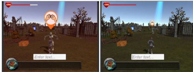
Fig. 4 The battle, the players have to correctly recognise the BSL signs shown on top of the enemy/minion by hitting the respective key on the keyboard to keep the enemy away.

The enemy in Level 3 was inspired by a collection of sea monsters. The enemy is bigger than the player's avatar and fearsome to add to the fear factor of the game [22].