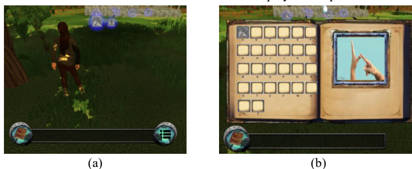
Fig. 2 (a) The forest environment in level 1 where the players collect the BSL signs; (b) inventory of the collected BSL signs and video playing the sign gesture.

At this level the game mechanics used is exploration, discovery and collection of signs to advance to the next level. There is no time constraint, rewards or penalties. Once all the letters in this level have been collected the players can proceed to level 2.