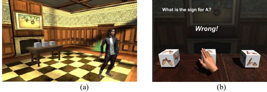
Fig. 3 Level 2 (a) The sheltered environment for practicing the signs; (b) The user recognizing the BSL signs using a leap Motion controller.