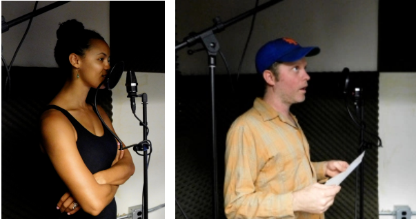
Figure 1: Two subjects from SINA-C recording audio at the Columbia University Computer Music Center in 2016.

files ( \Sigma 01 h: 10 m: 20 s, \mu 4.6 s, \pm 2.6 s). During processing of the data, some recordings were discarded due to poor recording quality, and some subjects recorded utterances multiple times, hence the imbalance across aspects of the corpus (cf. Figure 2).