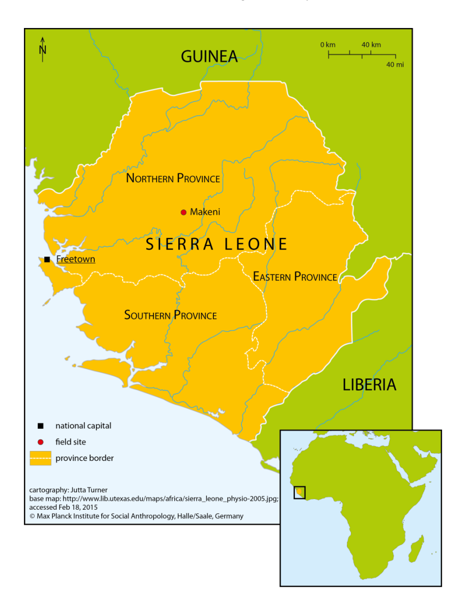
Map 1: Sierra Leone, province borders (including David O'Kane's field site Makeni)

and the north. Those peoples and communities are more and more aware of looming futures, both good and bad that await them. This is not a deterministic or fatalistic perception, rather it is the product of a set of influences and causal factors that, as on the Peninsula, will make certain modes of deployment of Kopytoff's frontier 'cultural inventory of symbols and practices' possible or even necessary, and which will reduce or eliminate the likelihood of other modes of deploying those cultural symbols. Just as the fading of the classic Turnerian frontier in the American west did not eliminate the frontier as a factor in national identity in the United States, the end of the classic precolonial African frontier identified by Kopytoff and others did not eliminate the frontier as a factor in the shaping of ethnic and national identities in colonial and postcolonial Africa. Not only did the historical legacy of the pre-colonial frontier remain stubbornly present in Africa, but the patterns of economic and political life in colonial and postcolonial Africa produced new forms of frontiers, with new consequences for identities and the societies which contained them. In the twenty-first century, new frontier processes are emerging – and in Sierra Leone as elsewhere in the continent they will add their own contribution to the remaking of identity in Africa.