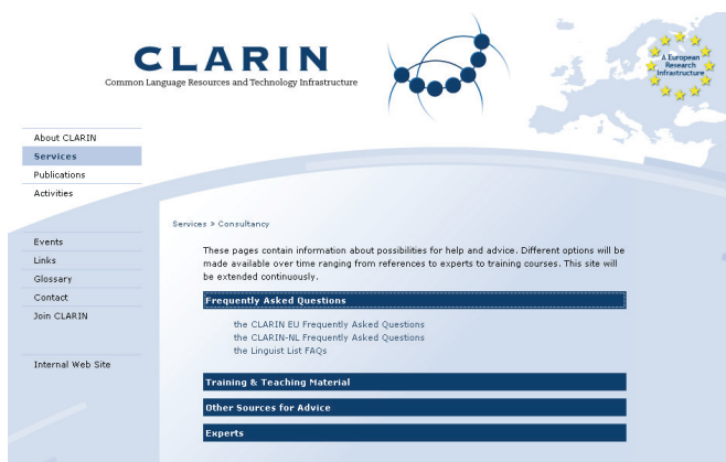
Figure 3: Links to FAQs, training material and human experts.