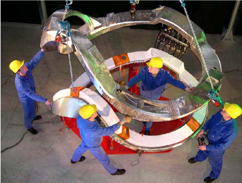
Fig 3: Assembly of the winding into the casing at BNG (Zeitz)