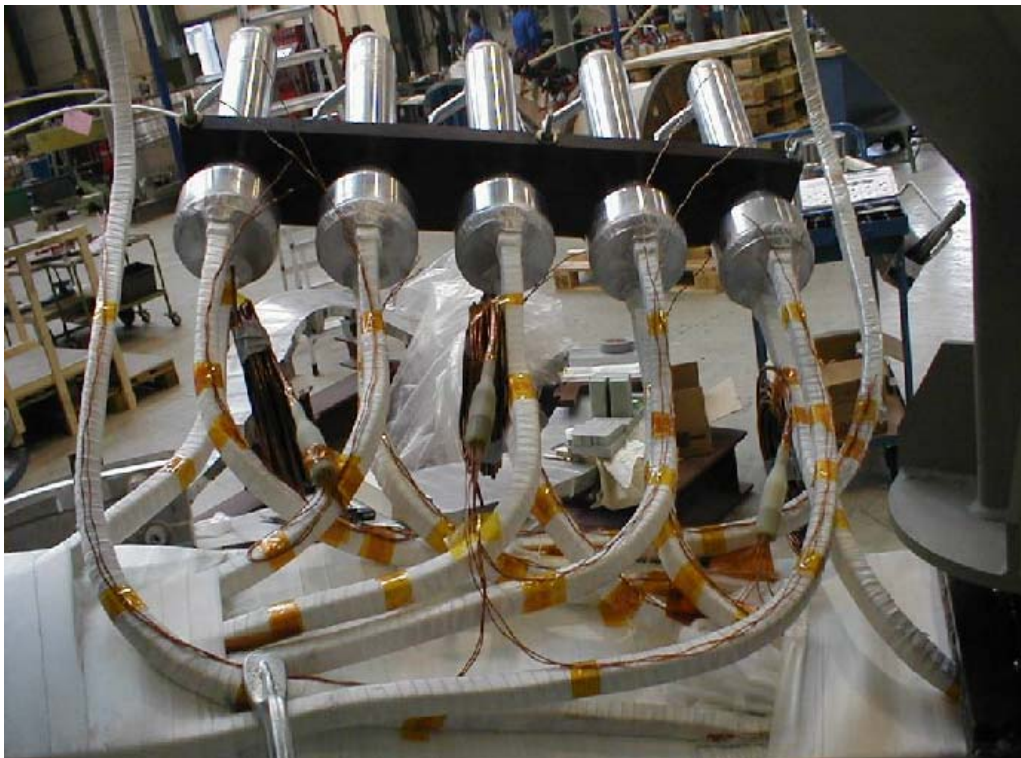
Fig 2. Terminal area of a non-planar winding pack