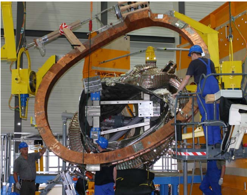
Fig. 4: Stringing of a planar coil across the plasma vessel