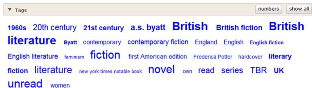
Fig.2. Screenshot of tags associated with A Whistling Woman from LibraryThing

LibraryThing, reveals that he understands the difficulty of classifying fiction when he writes, “Literary fiction isn’t ‘about’ what it’s about in quite the same way that non-fiction is” (2011). In other words, tags tend to be messy when it comes to fictional works.