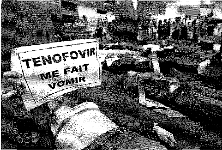
“Tenofovir makes me vomit.” ACT UP activists staged demonstrations against the PrEP trials at the 15 th International AIDS Conference. From Science Now, 2005. 49