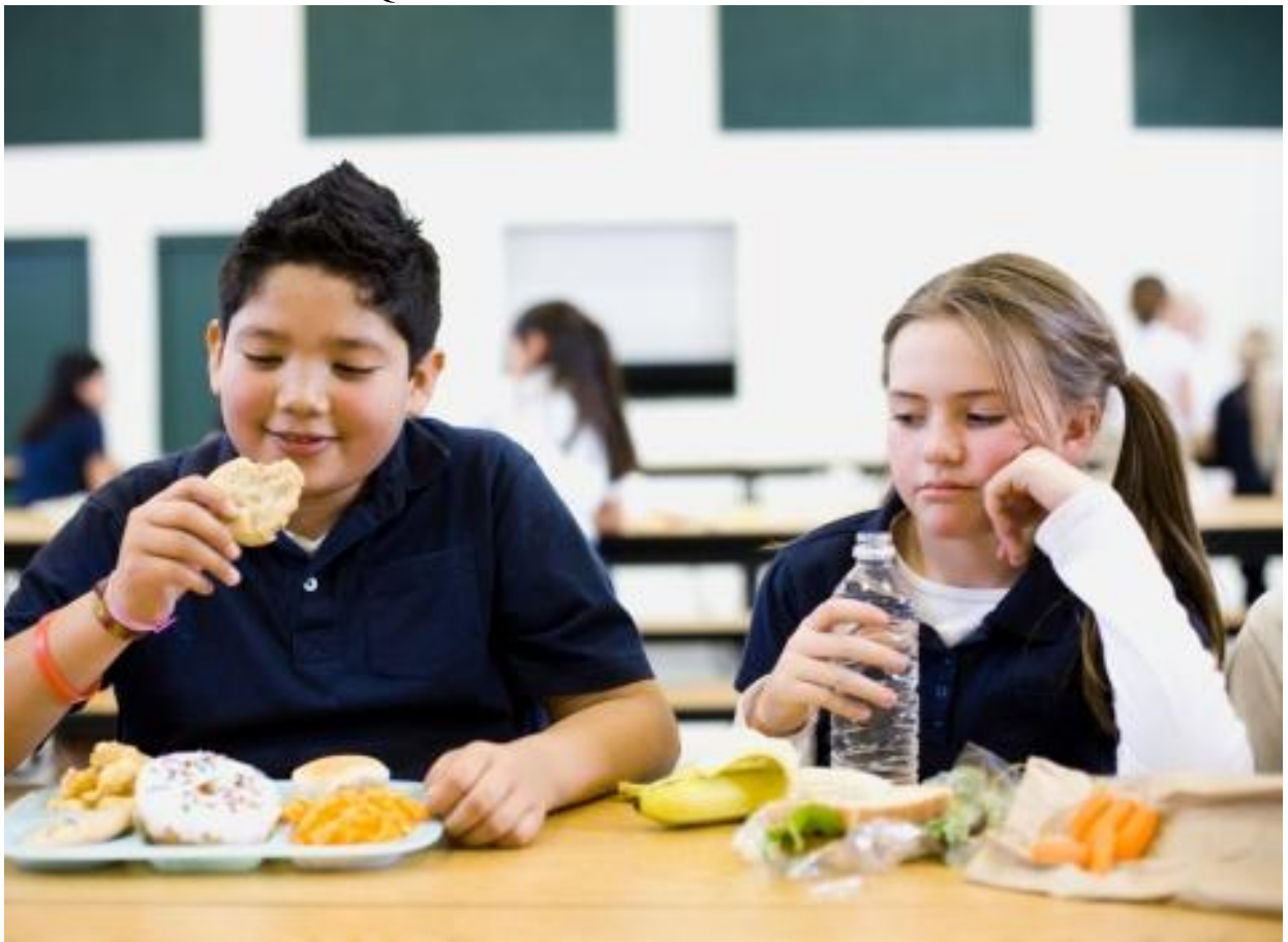
Figure 3.1 Picture Referent Used with Questions

In addition to controlling for morphosyntax, the frequency of vocabulary used in the questions was controlled across conditions. Because there is no corpus of words that lists the