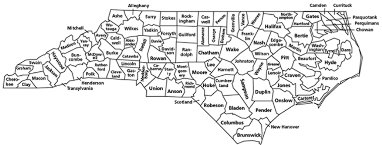
Figure 2. North Carolina County Map