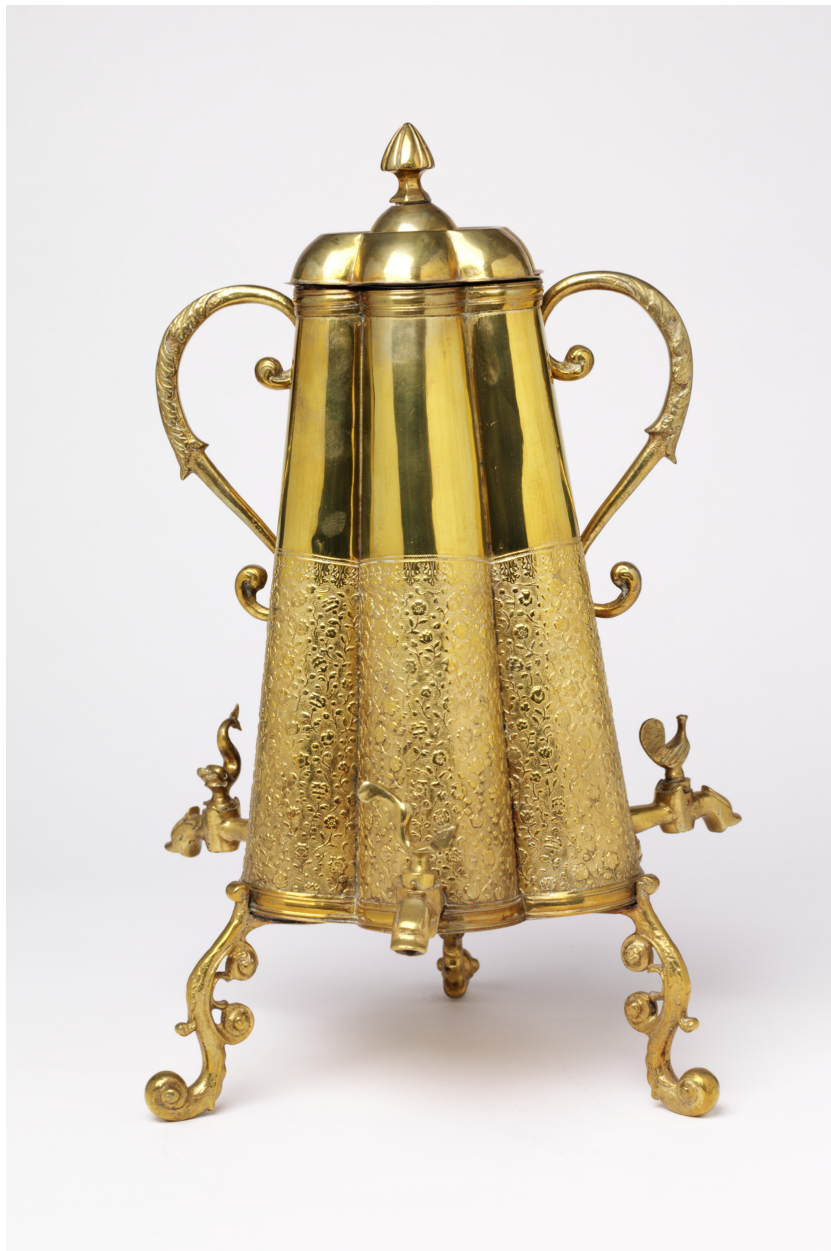
Figure 3.4. A gilt urn with separate chambers with taps for dispensing coffee, tea, and chocolate, made by an unknown Dutch metalsmith around 1700. A small spirit lamp could be placed underneath to keep the contents warm. Licensed for educational use by the Victoria and Albert Museum.