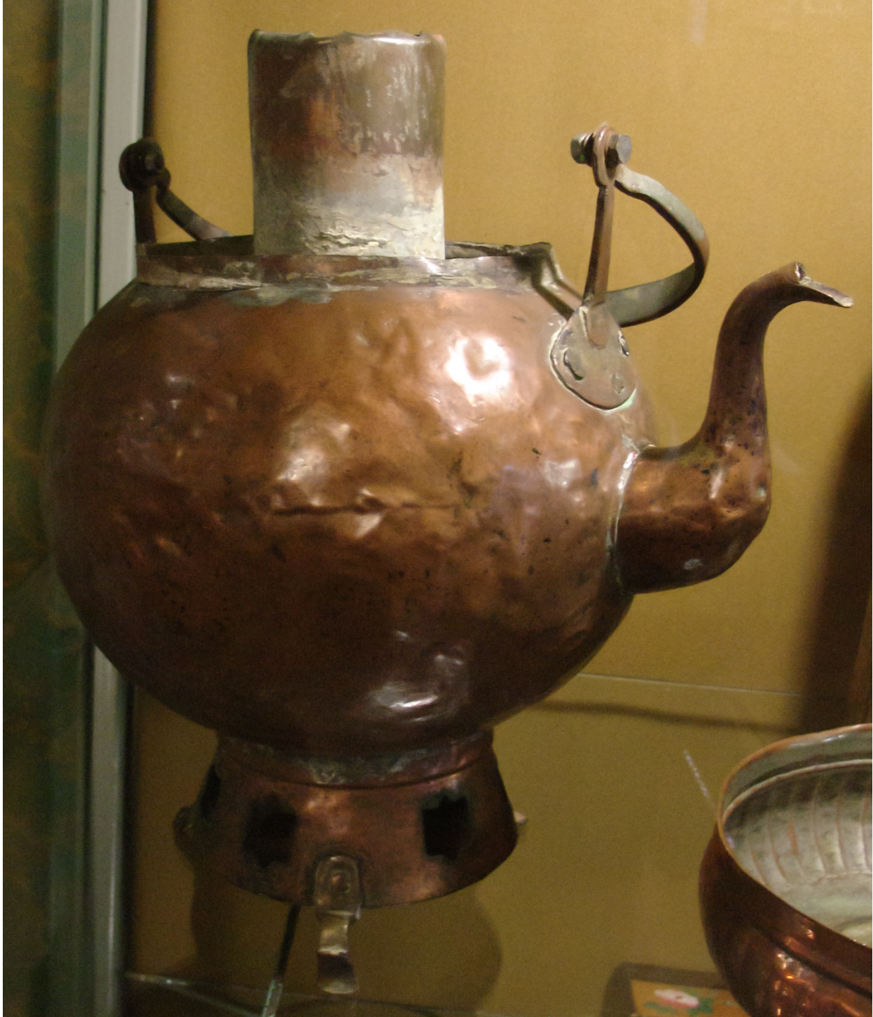
Figure 3.11. A late eighteenth-century sbitennik at the Museum of Russian Samovars in Tula. Public domain.