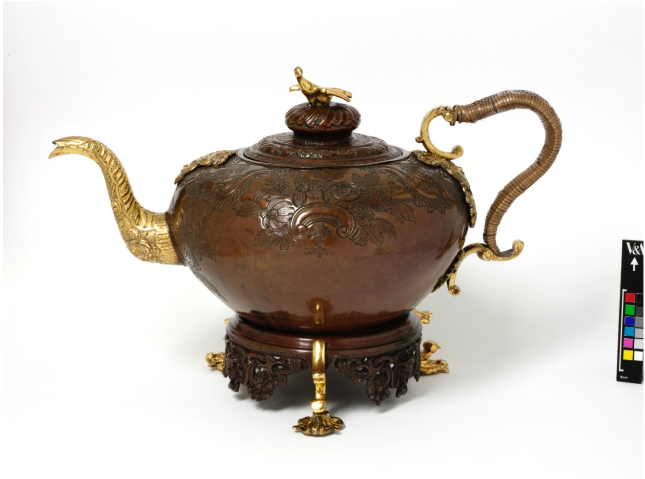
Figure 3.7. This German kettle, made around 1750 in Saxony, features a screen around the base designed to prevent drafts from blowing out the spirit lamp underneath.