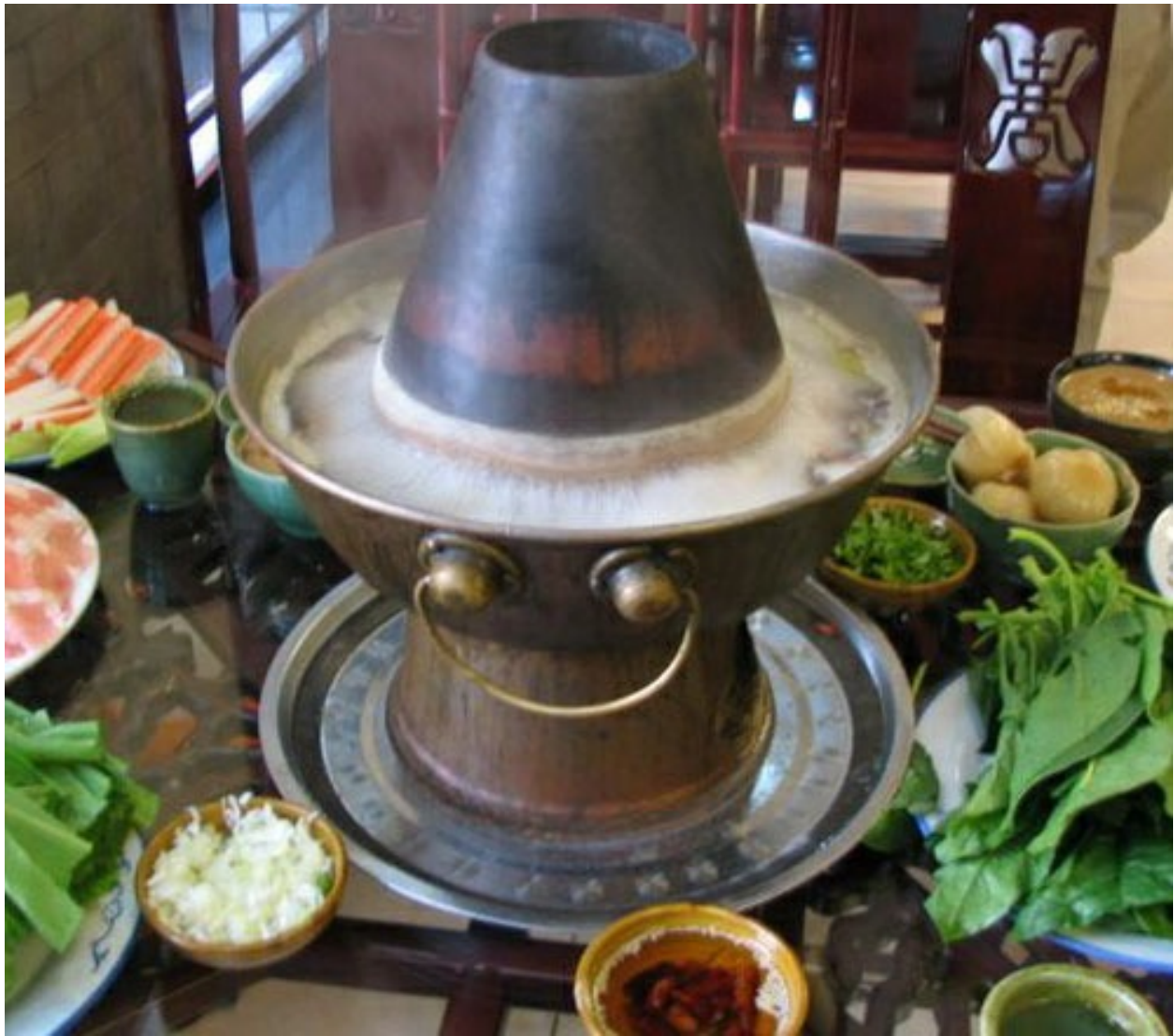
Figure 3.1. The vessel known as huo-go in China and sin-syol-lo in Korea, used for stew. Public domain.