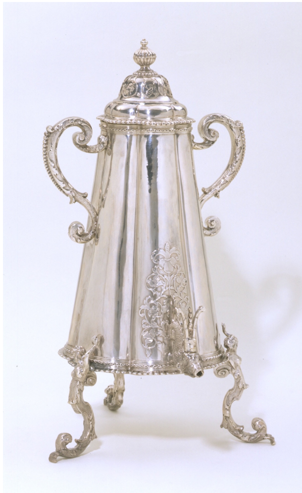
Figure 3.5. A silver coffee urn made in 1714 by the Amsterdam silversmith Otto Albrink. A small spirit lamp could be placed underneath. Licensed for educational use by the Victoria and Albert Museum.