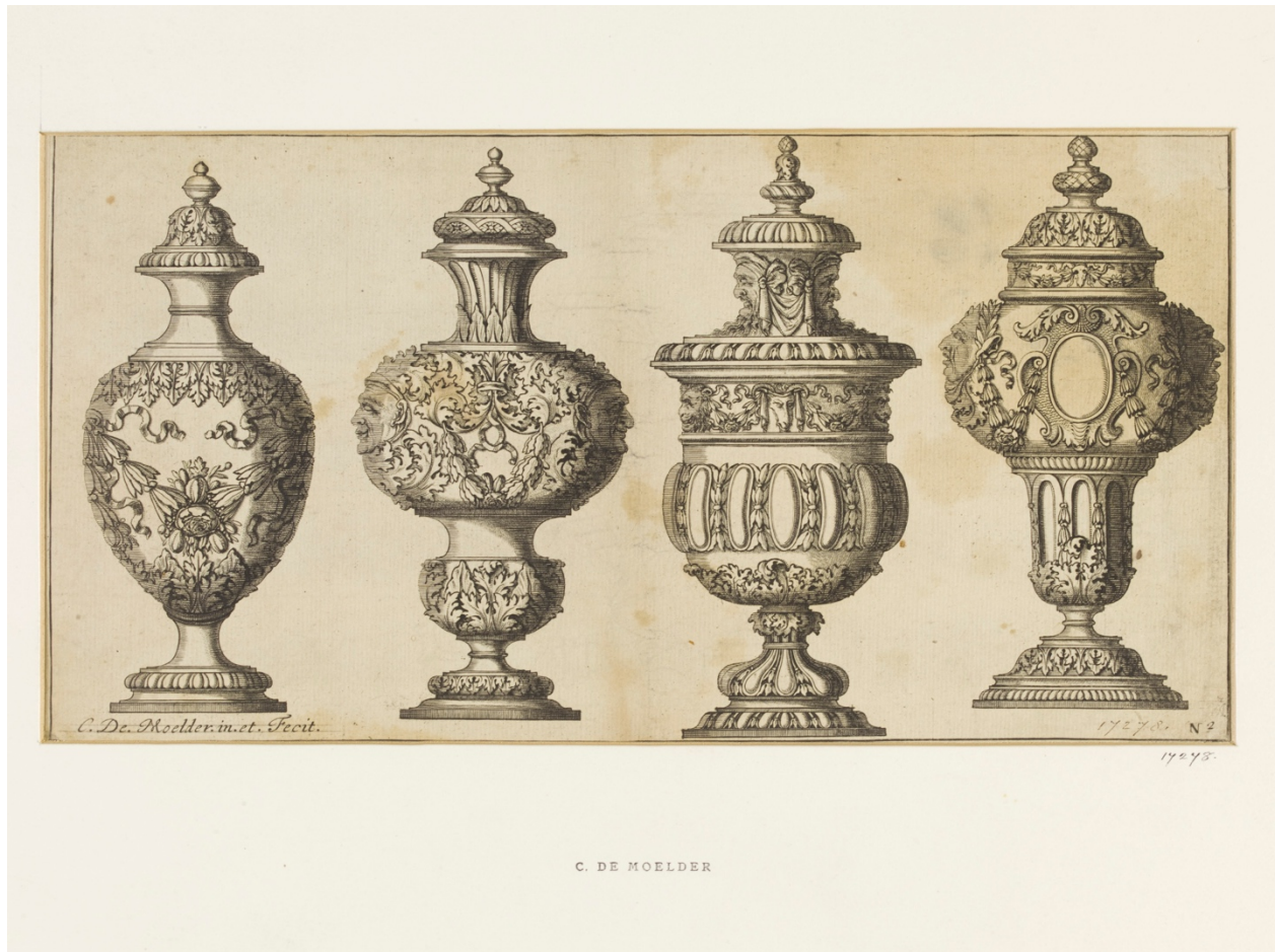
Figure 3.8. In 1694, London-based engraver Charles de Moelder was dreaming up designs for silver vases. The basic shape could be adapted to a variety of uses, including tea urns. Licensed for educational use by the Victoria and Albert Museum.