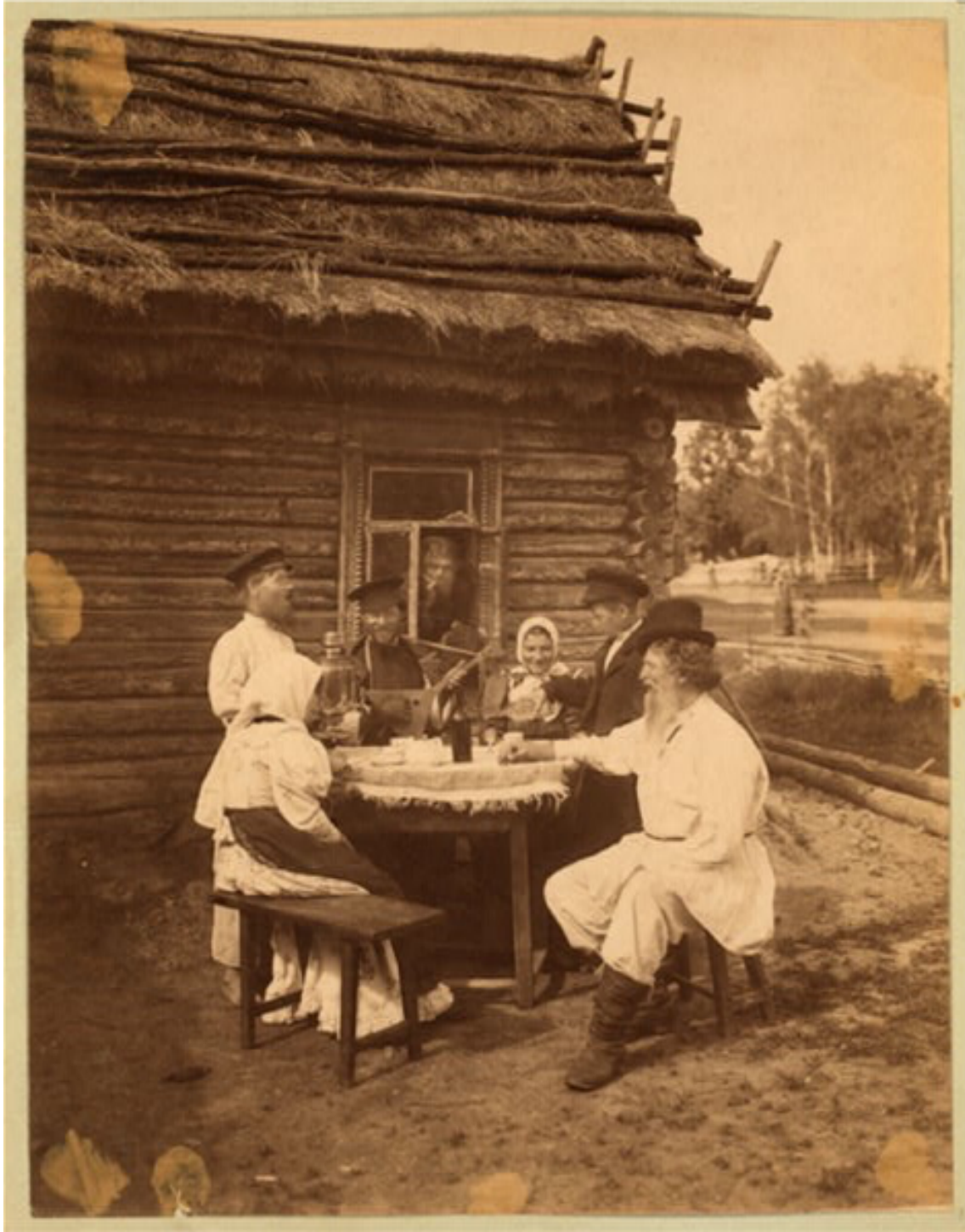
Figure 6.1. Staged genre photo of peasants seated around a samovar, c. 1875.