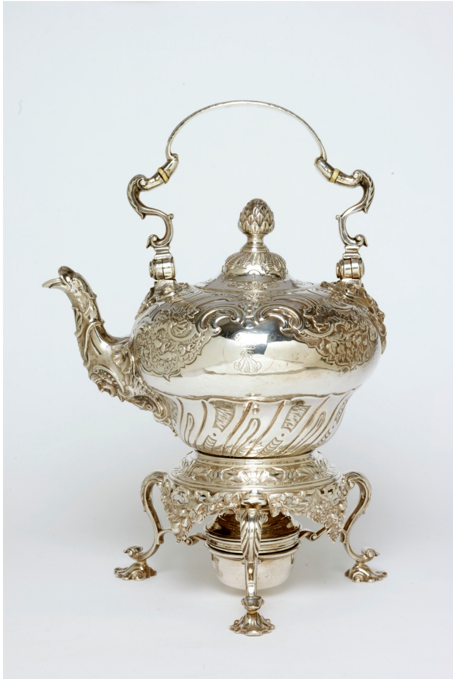
Figure 3.10. The vessel described in the 1742 Golitsyn inventory as a “white silver English heating teapot” was probably similar to this contemporary tea kettle with stand and spirit lamp made by George Wickes in 1742-43.