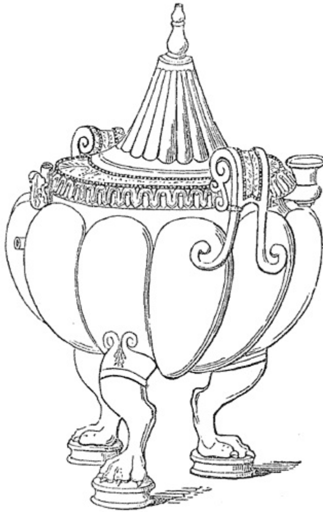
Figure 3.2. A Roman authepsa . Public domain.