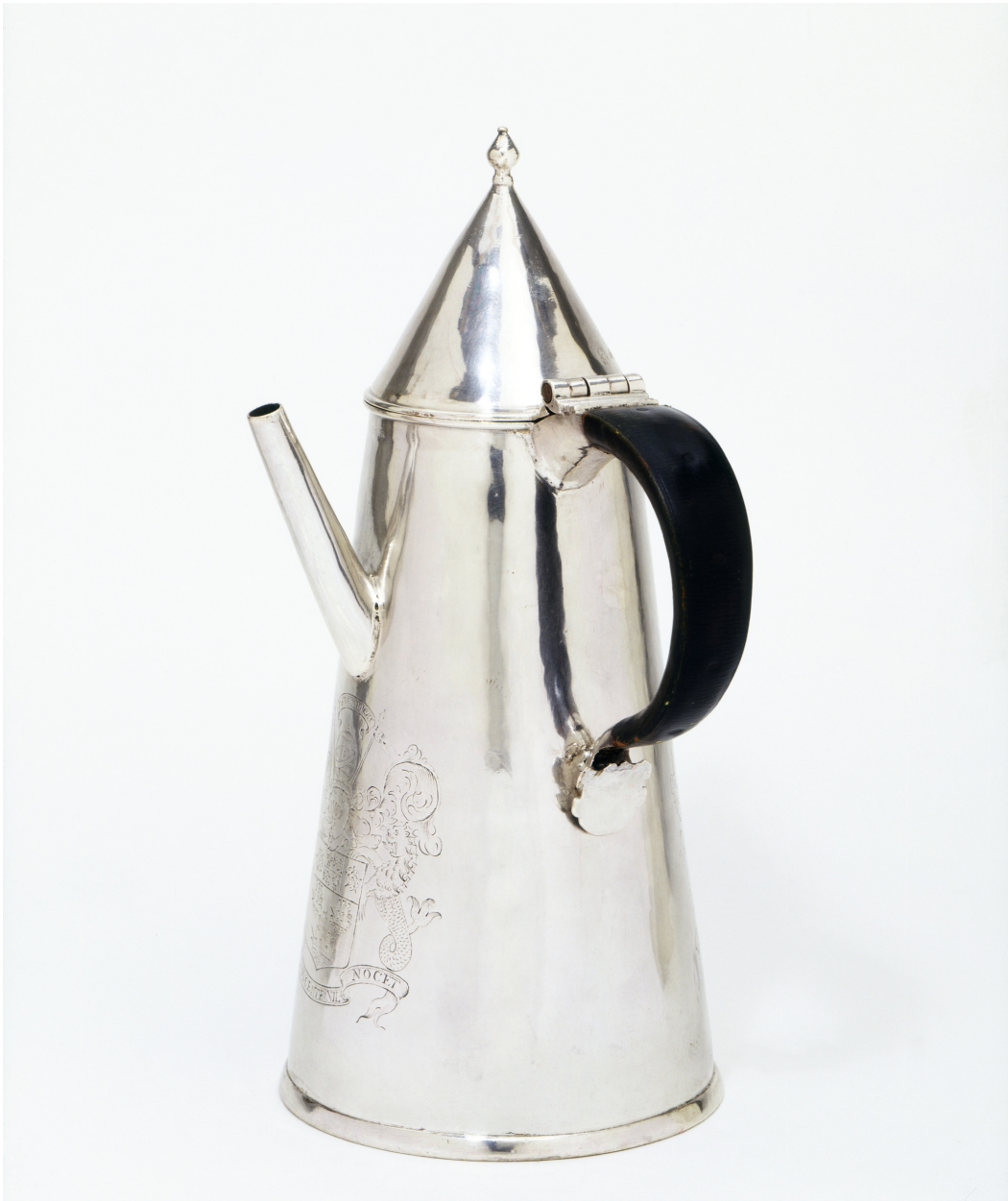
Figure 3.3. The oldest surviving English silver teapot, 1670. The inscription (not visible in this photo) explicitly identifies this as a tea vessel.