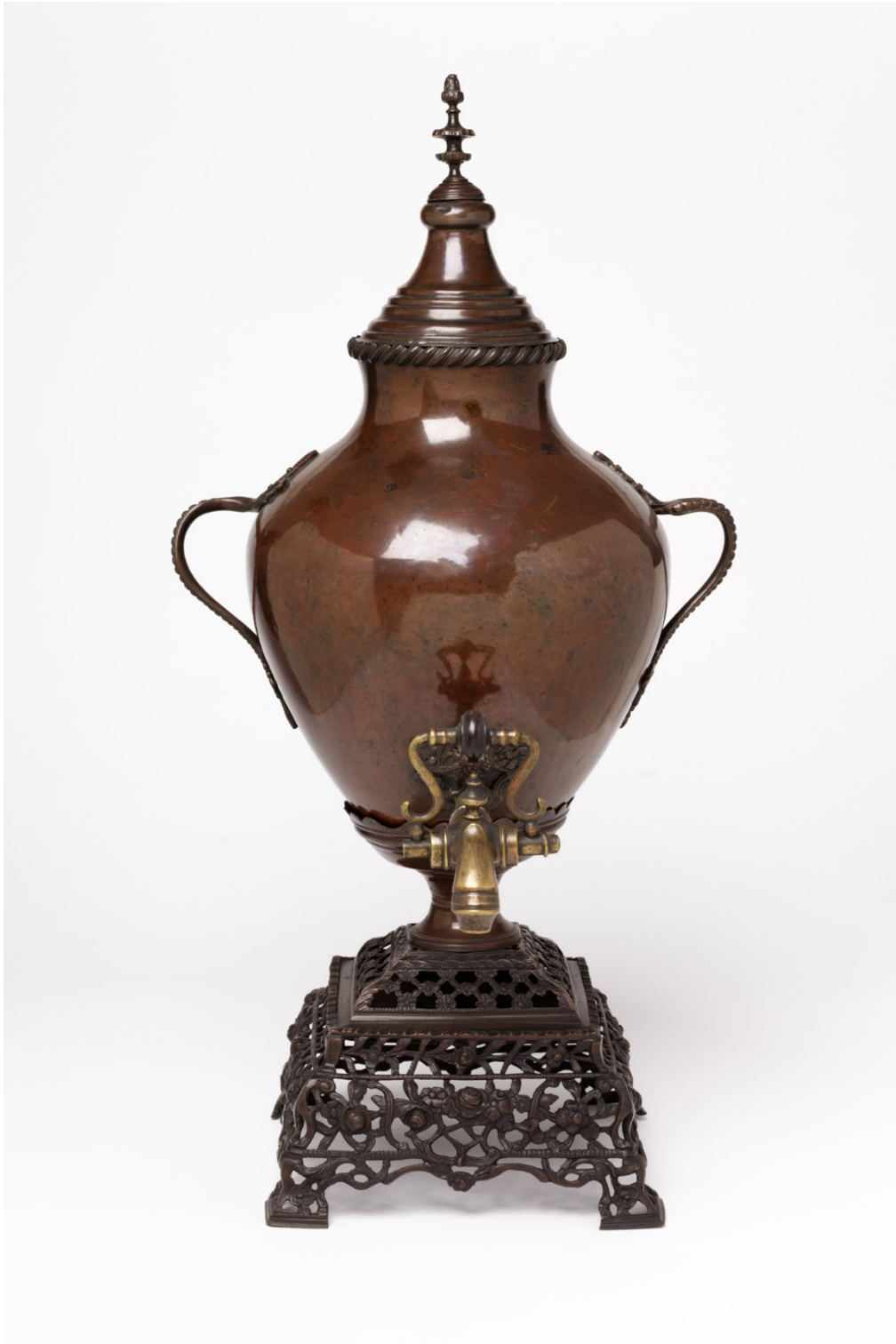
Figure 3.6. An early English tea urn in copper, 1750. This lampless version was heated by an interior cylindrical box iron.