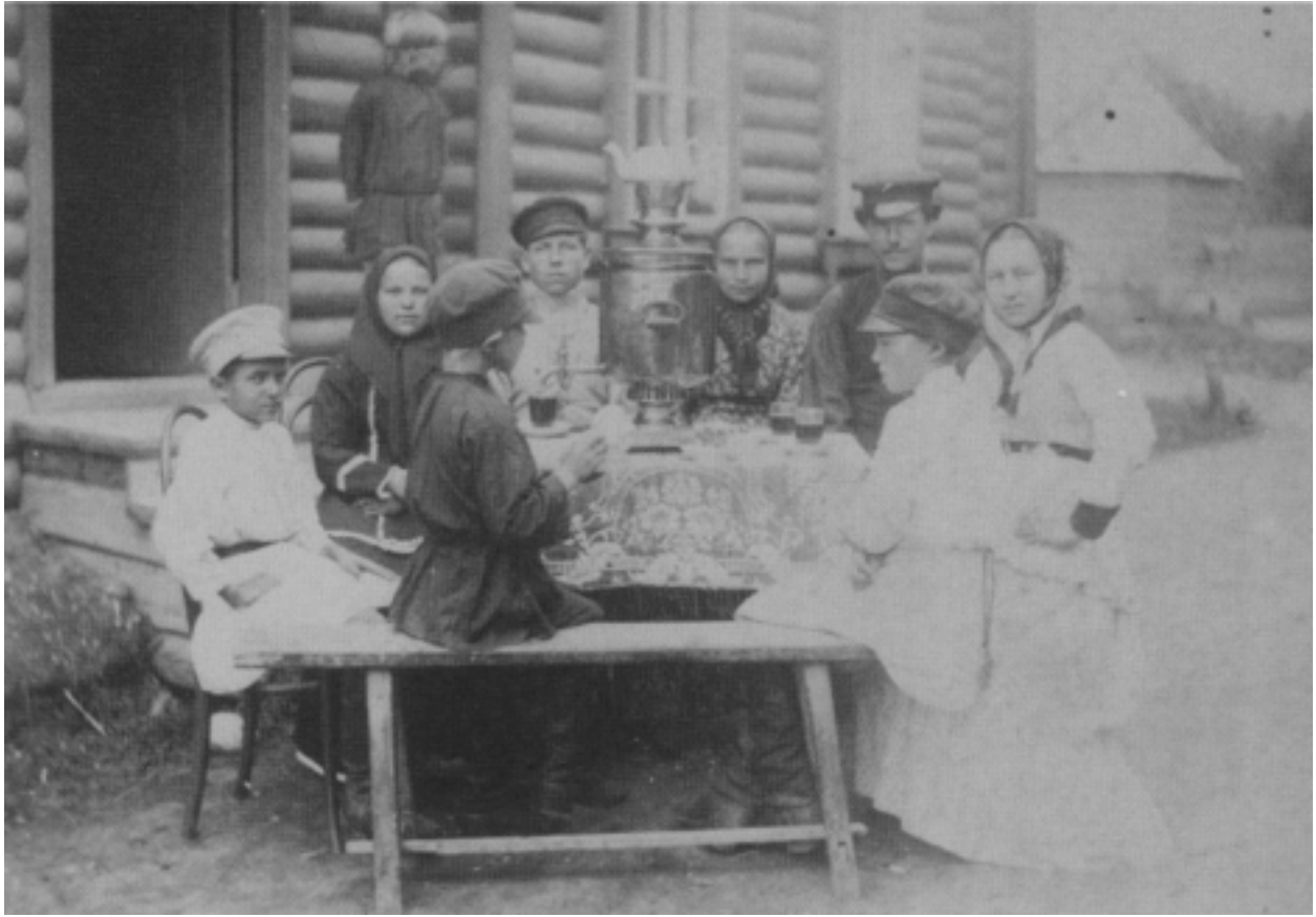
Figure 6.2. Posed photo of family gathered around samovar, made sometime after 1880. Library of Congress, Prints and Photographs Division, 89714845.