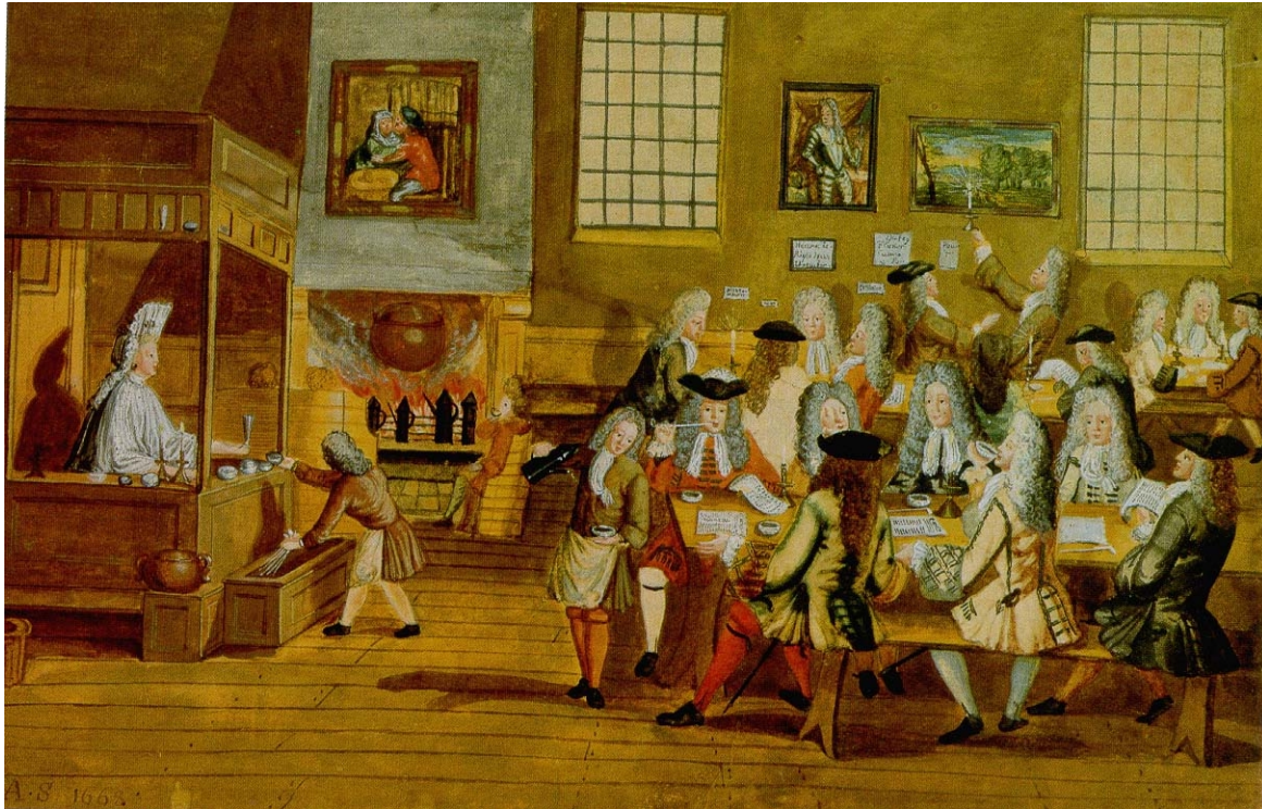
Figure 3.12. Illustration of the interior of a London coffeehouse, c. 1700, clearly showing hot water boiling over an open fire and a number of coffee pots standing on the hearth. Public domain.