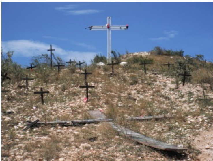
Figure 44: Uprooted Crosses at St. Christophe

For Herold, the dead are just at the surface, rising up through the dust, as close as if they had never been buried. They are not part of the past at all, and we do not have to struggle to remember them. They are just beyond us, in the invisible realm, and not so hard to reach. The dead are a discomfiting part of the present, threatening us with their proximity.