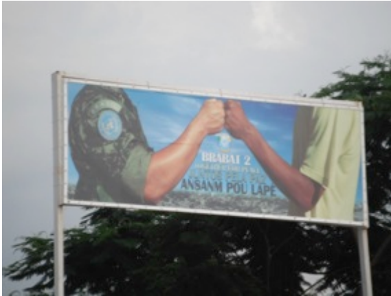
Figure 13: “Together for Peace”

Promotional billboard outside Brazilian Battalion, showing MINUSTAH peacekeepers in cooperation with Haitian civilians