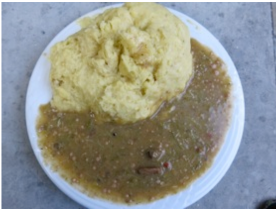
Figure 7: Tonmtonm with okra sauce.