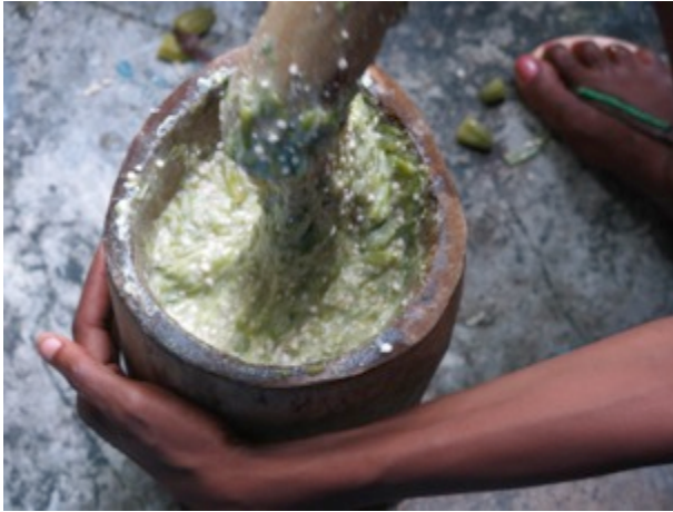
Figure 8: Whipping boiled okra for maximum slipperiness, pedicure in background (Port-au-Prince, 2013)

sauce to be less slimy than it should be.