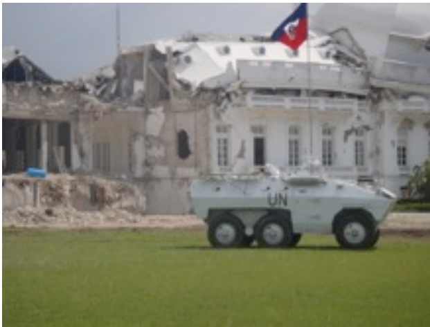
Figure 15: MINUSTAH tank in front of destroyed National Palace

In decrying MINUSTAH as an occupation, Haitian people are directly invoking the memory of the 1915-1934 US Marine occupation (Greenburg 2014). In a technical and historical sense, the current UN operation differs from the first US occupation as it is not an explicitly imperial undertaking with direct and visible displays of military and economic hegemony; nonetheless, the indirect power and “democratizing” goals of the United States and its participation in a global police force are part of what Beckett terms “phantom power” (Beckett 2010). From the perspective of Haitian people, it all looks like occupation of a supposedly sovereign land.