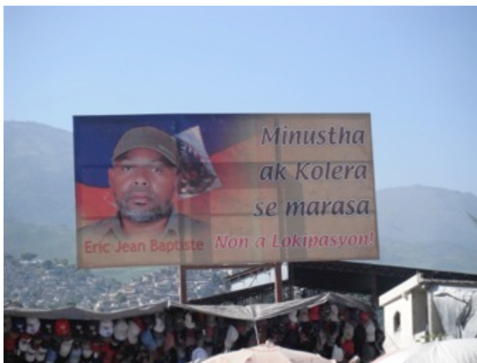
Figure 14: "MINUSTAH and Cholera are Twins: No to occupation!"

The fact that the recent cholera epidemic in Haiti— which began in late October 2010 and which continues to wax and wane to this day – almost certainly arrived with Nepali blue helmets substantiates the rumors and distrust toward MINUSTAH. It may be unfair to impugn the individual peacekeepers (who unwittingly carried in their bodies the bacilli from another poor and structurally violent nation) and fairer to condemn the UN as an institution (for outsourcing the policing of poor countries to people from other poor countries), as well as the Haitian-run sanitation company whose negligent construction allowed peacekeeper sewage to seep into the Artibonite river. But in the popular imagination, it is simply "MINUSTAH" that is at fault. "MINUSTAH came to give people cholera. They put something in the water." "MINUSTAH brought cholera to kill Haitians, because they hate Haitians." This rhetoric allowed businessman Eric Jean-Baptiste to successfully run for mayor of the Carrefour neighborhood of Port-au-Prince with the slogan "MINISTA AK KOLERA SE MARASA" (MINUSTAH AND CHOLERA ARE TWINS). It gave MINUSTAH's many opponents further grounds on which to denounce the "occupation."