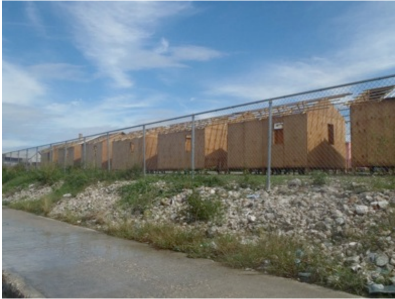
Figure 21: Plywood “T-shelters” under construction in Cité Militaire, Port-au-Prince