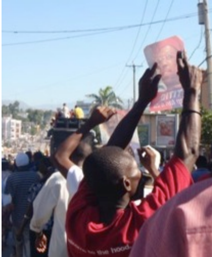
Figure 12: “Titid Nap Tann Ou” During a protest on December 16, 2009, the nineteenth anniversary of Aristide’s first election, a man bears a photograph of Aristide (affectionately nicknamed Titid) with the slogan “ TITID ap tann ou ” (Titid we’ll wait for you.)