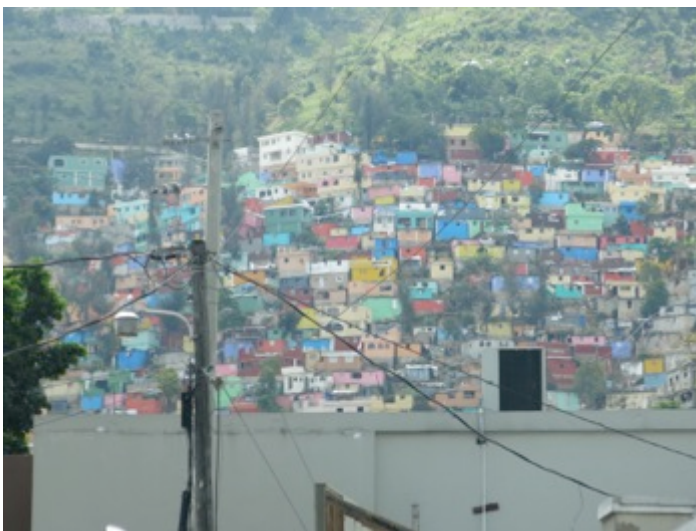
Figure 34: Jalousie, as glimpsed through Pétionville’s web of infrastructure.

On January 12, 2014, the fourth anniversary of the earthquake, a friend of mine in Port-au-Prince posted a photo to Facebook. It shows the Pétionville bidonvil called Jalousie, which, like so many Port-au-Prince neighborhoods, was a vast hillside of winding dingy grey-beige cinderblock, until March 2013, when, for some $1.4 million US (Daniel 2013) the government painted it a garish and thrilling assortment of bright colors.