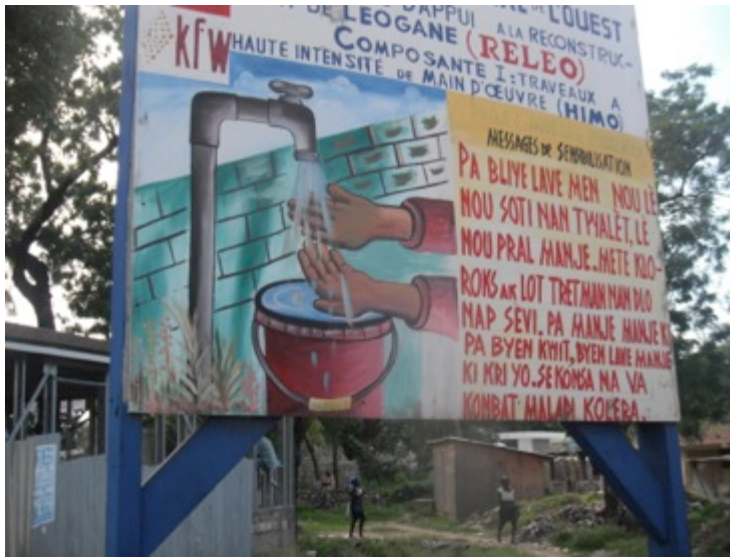
Figure 26: “Awareness message: Don’t forget to wash your hands after using the bathroom and before eating. Put Clorox and other treatments in the water you use. Don’t eat food that isn’t well-cooked, and wash raw foods well. That is how we will combat the disease of cholera.”