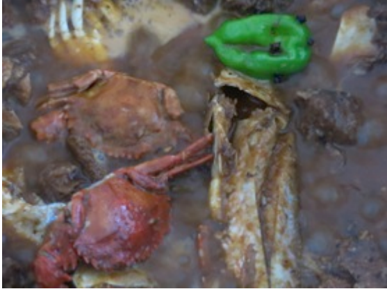
Figure 6: Okra sauce, full of meat, fish, small crabs, and a clove-studded pepper.