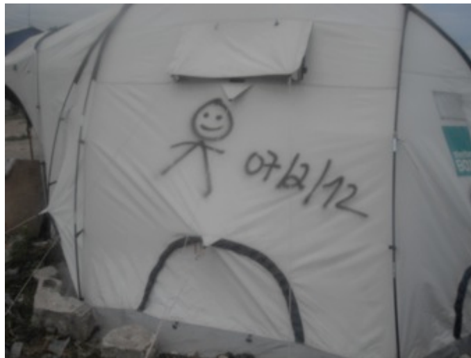
Figure 32: Nadia and Ezekiel's ShelterBox, with stick figure. February 2012

We arrived at Ezekiel's tent. It was a ShelterBox, a relatively spacious white tent created for post-disaster situations and distributed by relief groups.