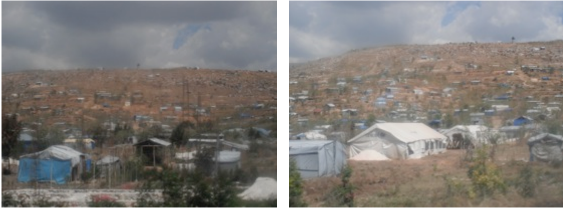
Figure 39 and Figure 40: Hills of Titanyen

and churches and development projects, set up by a variety of NGOs and missions. There is no running water, only sporadic water pumps, and no shade beyond the tarps and roofs that people erect themselves.