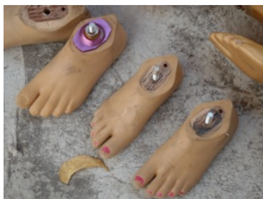
Figure 16 and Figure 17: Used prostheses

On the ground of the outdoor area where the physical therapists work lay a collection of used, slightly grimy-looking below-the-knee prosthetic legs. The joints were brightly-colored. The calves had been decorated — one with an image of Disney’s Cinderella, two with the children’s character Strawberry Shortcake. The toenails of the prosthetic feet were painted pink. They were all made with white people in mind.