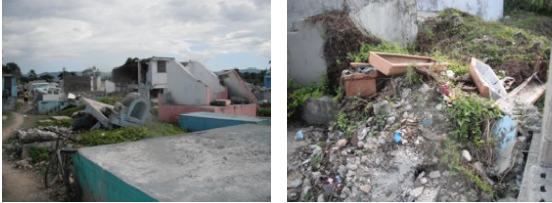
Figure 35 and Figure 36: Cemetery in Léogâne. November 2011

I am in Léogâne for Fèt Gede, the Haitian Day of the Dead celebration, celebrating the Gede spirits who serve as intermediaries between life and death, and indeed preside "over all aspects of life's beginning and end, from ancestors and future progeny to sex and death" (Smith 2010). Gede spirits are explicitly sexual. They speak in a nasal voice that can be hard to understand, cake their faces vainly with white talcum powder, wear sunglasses and a top hat (or several), drink and bathe their genitals and bodies with kleren with hot peppers soaking in it, dance provocatively (and entice you to dance, too), and shout and sing obscenities ( betiz ).