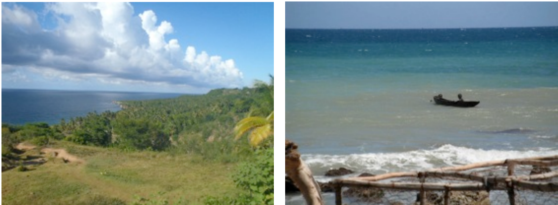
Figure 9 and Figure 10: Degerme, August 2010

Melise was the third of twelve children, of whom ten survived to adulthood, born to a peasant family in a place called Degerme. Degerme is in the commune of Abricots, about twenty mountainous kilometers from the city of Jérémie. It is a spread-out community of coconut palms, red dirt, and narrow, rocky paths, where people traditionally lived off the land — growing yams, plantains, breadfruit, and manioc — as well as the sea — catching fish and shellfish and the occasional unlucky dolphin. Melise spoke often of how beautiful it was there, how lovely the sea. Degèrme is astonishingly picturesque. It is verdant and mountainous, with warm ocean beaches and warmer freshwater inlets.