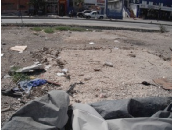
Figure 30: Where a tent once was Maïs Gaté 2, February 2012

Gaté 2 resembled not so much a camp as a scattering of tents on a barren field. It was clear where the tents had been – square-shaped outlines in the dirt, discarded prelas and bits of things, trash and the remnants of the materiality of everyday life.