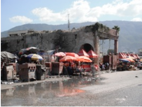
Figure 11: The past in the present