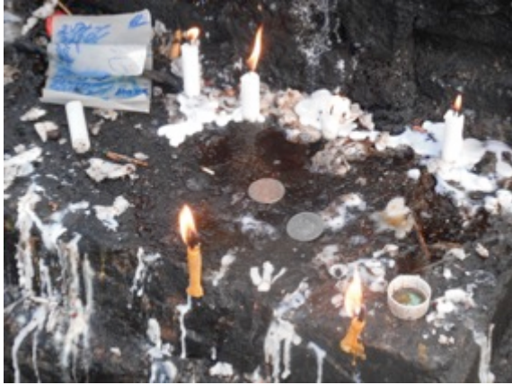
Figure 37: Offerings at the Kwa Bawòn