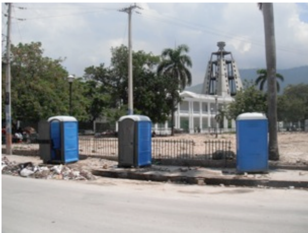
Figure 25: Public toilets during camp removal Champ-de-Mars, April 2012