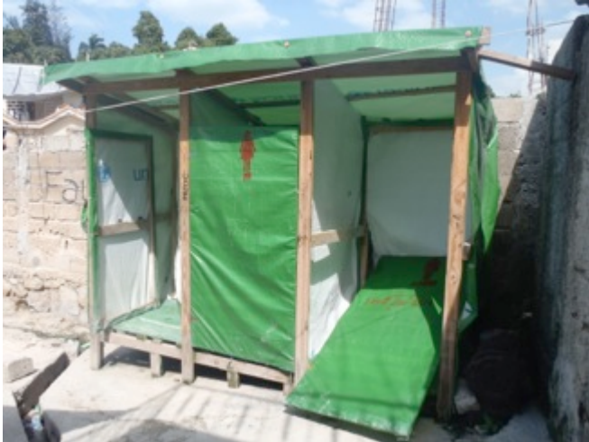
Figure 23: Public toilets