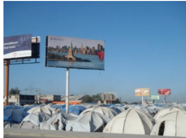
Figure 28 and Figure 29: Maïs Gaté 2, December 2010

For two years, Maïs Gaté 2 was densely packed. The tents came right up to the road, and it appeared impenetrable, like a sea of blue, white, and grey plastic. The Red Cross administered the removals in stages; the camp is decongested incrementally and thins out. Patches of dry, grassless dirt appeared between the tents, and grew wider, so that by mid-February 2012, Maïs