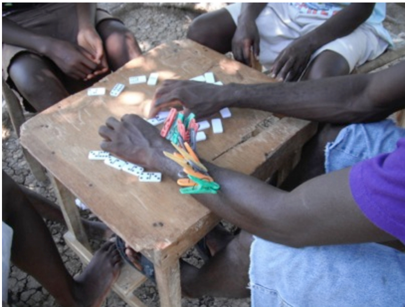
Figure 41: Losing at dominos at the wake.

As the sun went down, Claudine and several of her sisters and stepsisters sat outside at a little wooden table, playing dominos — men sometimes clip clothespins up the skin of their forearms to serve as "punishment" for losing, but the girls put palm leaves tied into makeshift wreaths around their necks instead.