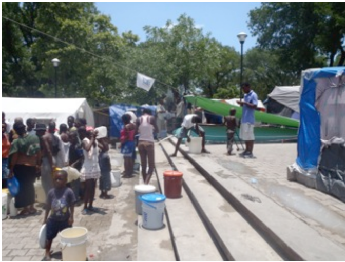
Figure 19: Distribution of potable water in a rubber blad

dynamics of the UN peacekeeping structure were, understandably, erased in this telling, and the meaning of the cholera epidemic became clear and one-sided: they are against us, and wish to do us harm. This makes even more sense in the context of existing apprehensions about the water that international organizations were distributing in the months after the earthquake. In trucks or in great rubber blad , the water was said to be potable but few Haitians drank it. They bathed with it, they washed their clothes with it, but they continued to buy water to drink.