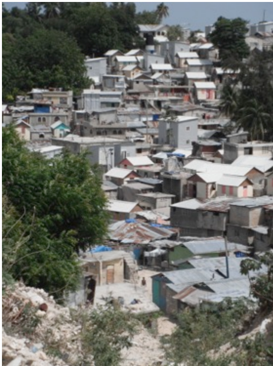
Figure 22: T-shelters, amid existing concrete structures

Christ-Roi/Nazon, Port-au-Prince, April 2012