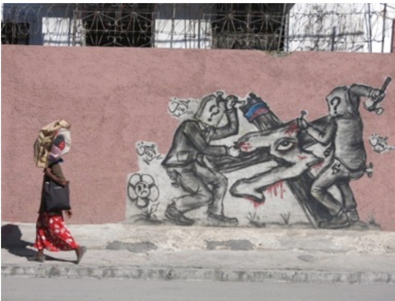
Figure 42: Haiti nailed to the cross by unknown aggressors