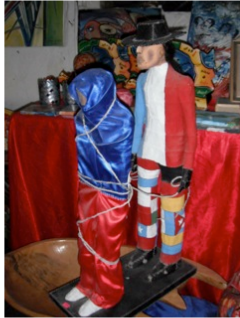
Figure 20: The international community bòkò drives the Haitian zombi.