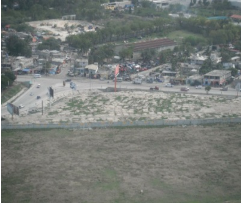
Figure 33: An image of absence: Maïs Gaté 2, seen from above, March 2012, less than two weeks after final “decongestion” of the camp. Each bare square represents the place a tent once stood.