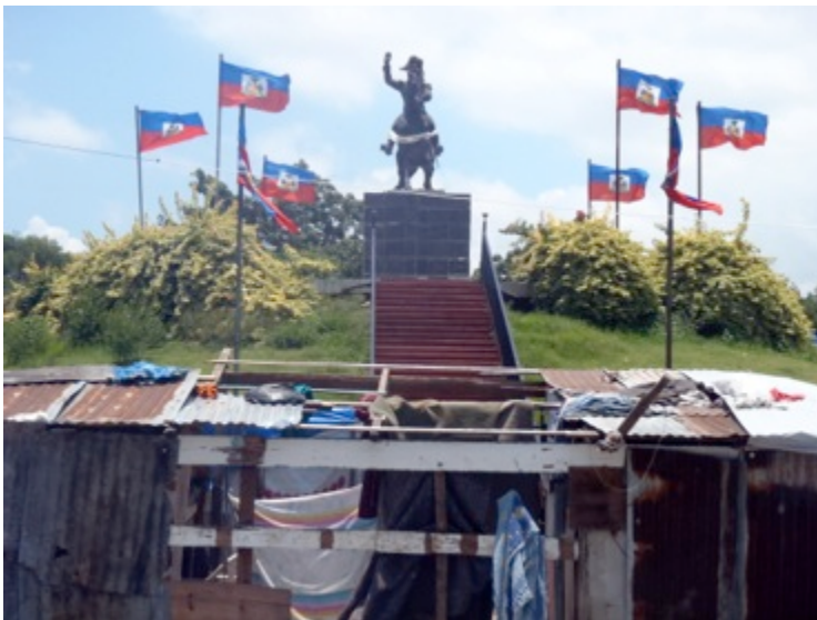
Figure 3: Jean-Jacques Dessalines above the Champ-de-Mars IDP camp

[their] narrative mythical, in the anthropological sense, was not its truth or falsity, but the fact that it was concerned with order in a fundamental, cosmological sense" (55 - italics Malkki's). It is important to reiterate that the events that I am about to discuss are not untrue (though some of them, I will try to show, are subject to immense controversy); it is their interpretation and perceived connection to moral order that render them "mythical." The principal events that form this mythicohistory are the Haitian Revolution and its immediate aftermath, and the two hundred years of foreign interventions and political upheaval that came after the revolution. Many of these events — from the Revolution and the death of Dessalines, to the US occupation of 1915-1934, to the Duvalier regime, the increasing presence of international organizations, and the presidency and exile(s) of Aristide — have been interpreted and reinterpreted in moral terms that relate to Haitian emancipation, independence, sovereignty, and justice (Casimir 2004).