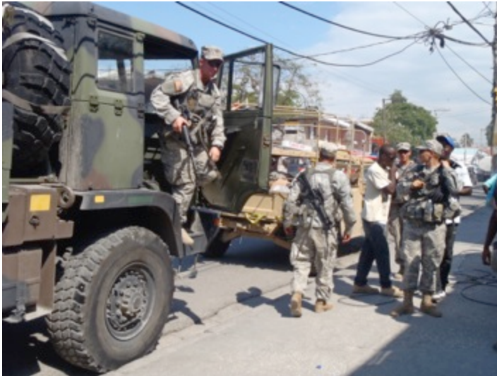
Figure 18: US troops, part of Operation Unified Response, on an armed patrol of Route Delmas in Port-au-Prince with their Haitian translators.

“Chaos lurks around the corner,” says the Marines' webpage about Operation Unified Response. “And where there is chaos there are Marines nearby; ready and able to silence it.”)