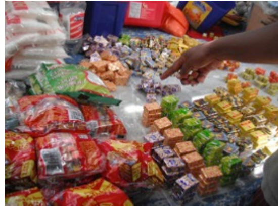
Figure 4: USAID rice. Port-au-Prince, April 2010