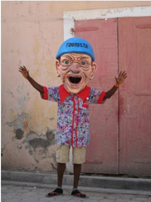
Figure 27: TOURISTA, Jacmel, February 2012

faces, Hawaiian shirts, and "TOURISTA" emblazed on their blue helmets.