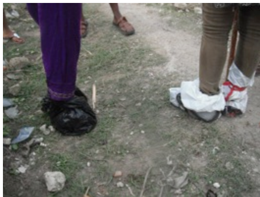
Figure 38: Waterproof Gede Feet

Two worshippers approach the cross, two women, both mounted by Gede spirits. One wears a white T-shirt with black shorts, and her shirt bulges with the coins and small bills she's received as offerings today. Her face is white with talcum, and she leans on a long, heavy wooden walking stick that she positions like a penis. The other woman wears a marvelous purple satin outfit with gold trim and a foppish black hat, and one-eyed black sunglasses. Her neck is dusty with talcum, and a cigarette hangs out of the corner of her mouth. She has a sweet, shy smile. Both women's feet are wrapped bulkily in plastic bags: when people die, they are said to go anba dlo (underwater), and so Gede spirits fear water; they are afraid of getting their feet wet.