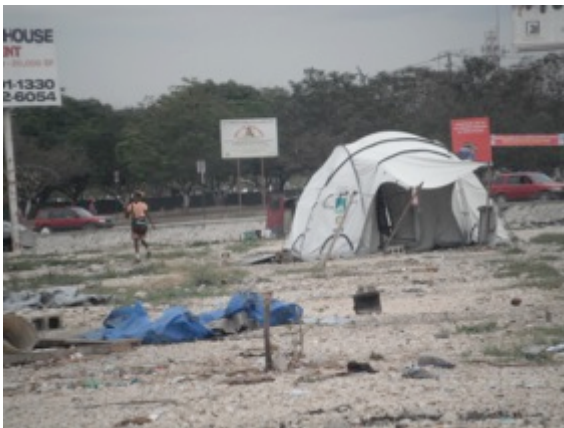
Figure 31: One of few remaining ShelterBoxes at Maïs Gaté 2, surrounded by empty spots where tents had stood prior to “decongestion.” February 2012.

Closer to the airport, at Maïs Gaté 1, the government planted flowers in time for a three-hour visit from the Brazilian president, Dilma Roussef. There were posters through the city, in Creole and Portuguese: “Welcome, Dilma! This is Your Home!” The soil where they planted the flowers looks dark, soft, and recent.