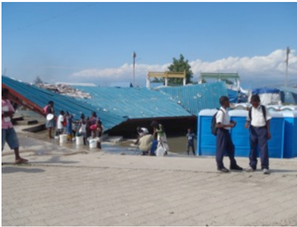
Figure 24: Water collection near public toilets in a public plaza destroyed by the earthquake

Photo taken the week cholera was first identified in Haiti