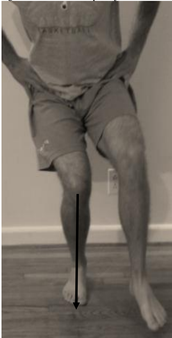
Figure 1.1 Control Group Subject