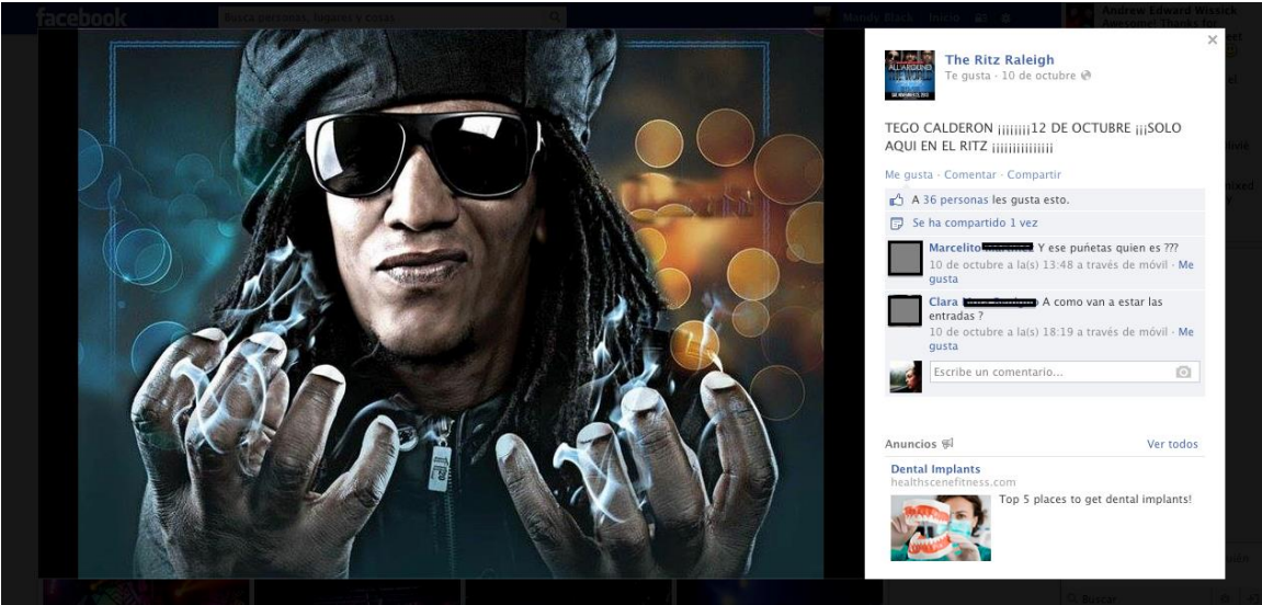
Figure 1: Tego Calderón Promotional Photo