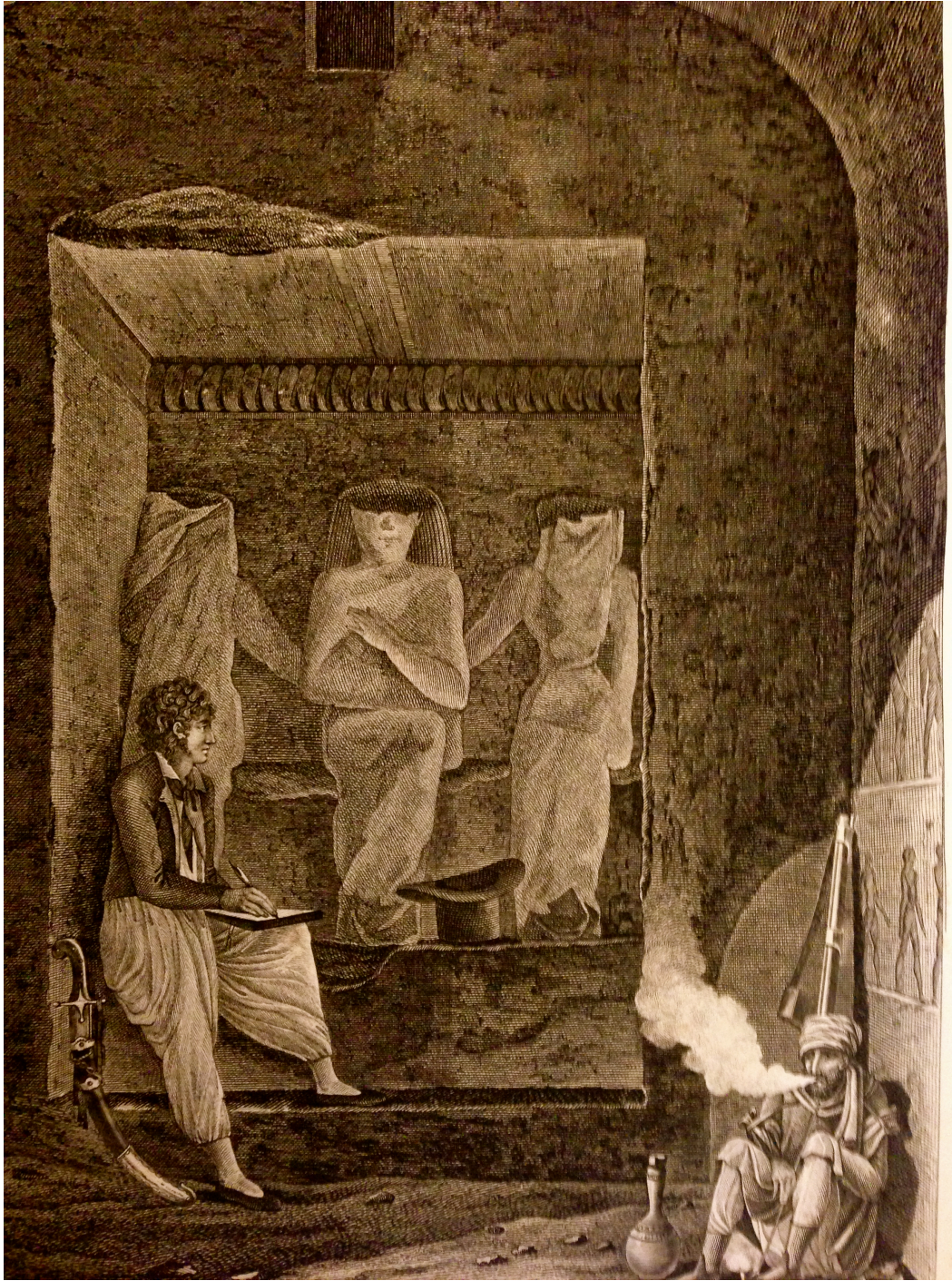
Image 7: Vue d'une ancienne carriere, Antiquités, Volume I, Book I, Plate 64.