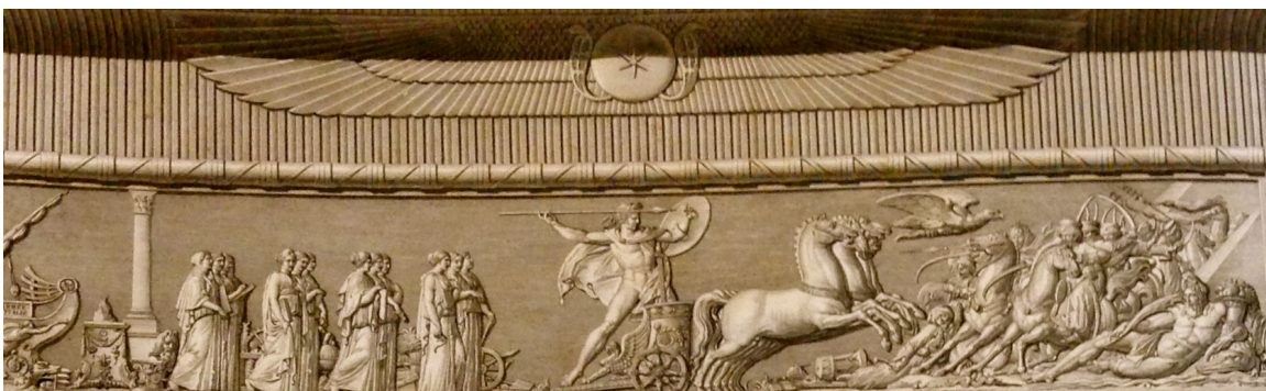
Image 6: Section of the Frame Surrounding the Frontispiece. It depicts Napoleon as the Western Hero.