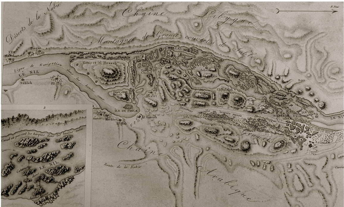
Image 3: Vue et plans de la cataracte de Syène et des environs, Antiquités, Vol I, Book I, Plate 30