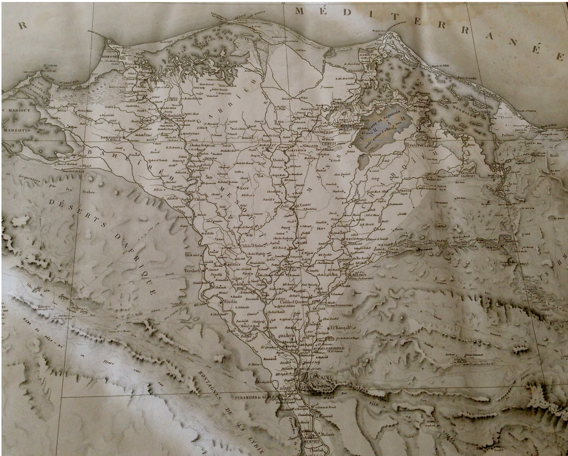
Image 2: Carte Hydrographique, État Moderne, Vol I, Plate 10, La Description de L'Égypte