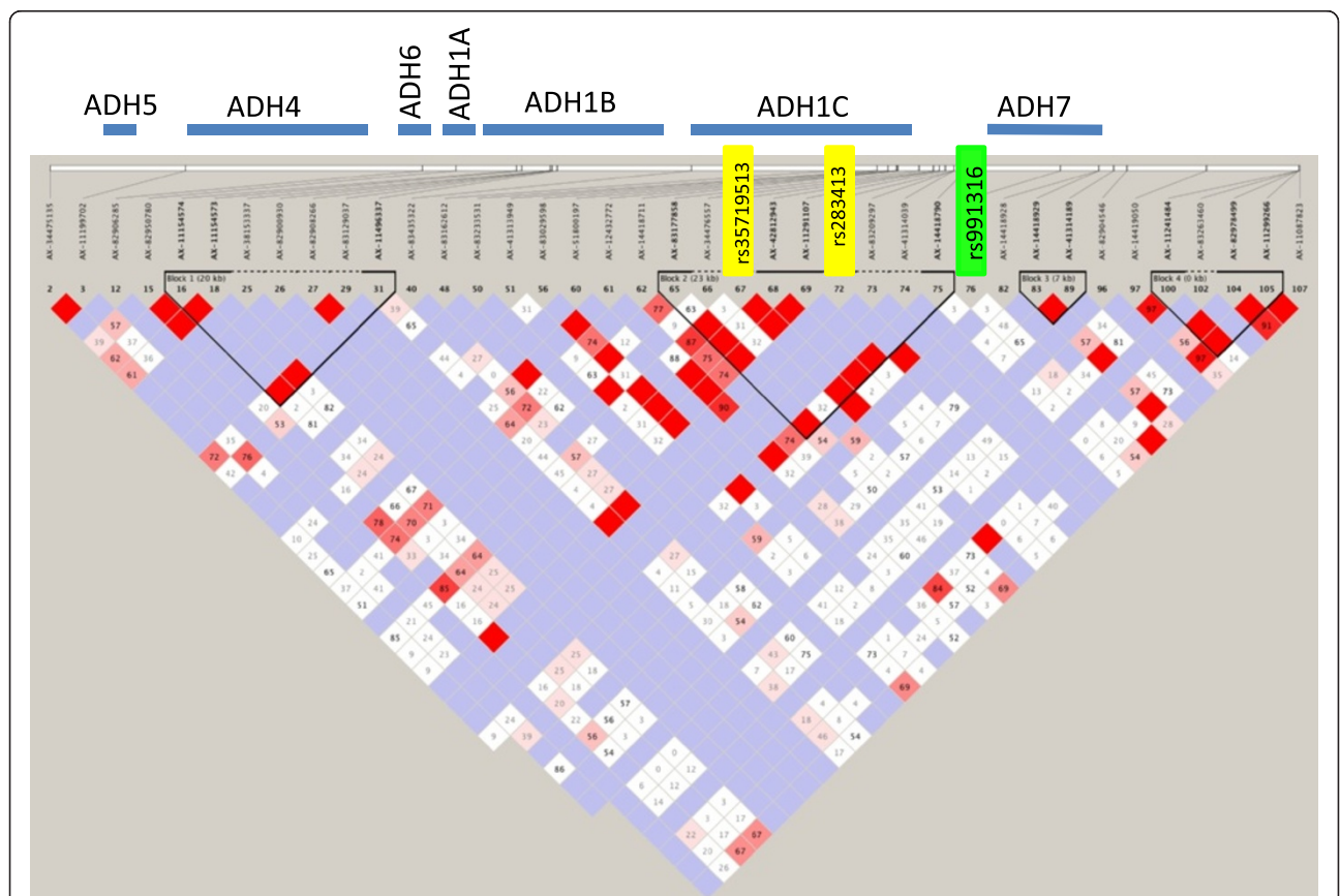
Figure 3 Linkage disequilibrium (LD) plot across ADH gene cluster. This plot illustrates the linkage disequilibrium between SNPs genotyped across chromosome 4 encompassing the ADH gene cluster. LD was measured using D' . Blue bars above the plot indicate the gene locations. Increasing levels of LD are indicated by pink and red squares, with red squares demonstrating the highest confidence linkage estimates. The green rectangle highlights SNP rs991316. The yellow rectangles highlight the two SNPs in ADH1C that were in LD with SNP rs991316.

Because this particular variant near ADH7 (rs991316) had not been previously reported to be associated with alcohol dependence, we wanted to rule out the possibility that this effect was simply the result of LD with a variant in one of the other ADH genes. The LD analysis produced a high average LD across the entire ADH gene region ( D' = 0.76 ), demonstrating that this region is important in alcohol dependence. However, as can be seen in Figure 3, there are very few individual SNPs that are in complete LD with rs991316. This result was expected based on previous reports that there is not strong LD between ADH7 and the other ADH gene classes [39]. Even within the ADH7 gene itself, there exists substantial diversity in the haplotypes in a 23 kb region around ADH7 , within and among 38 global populations [45].