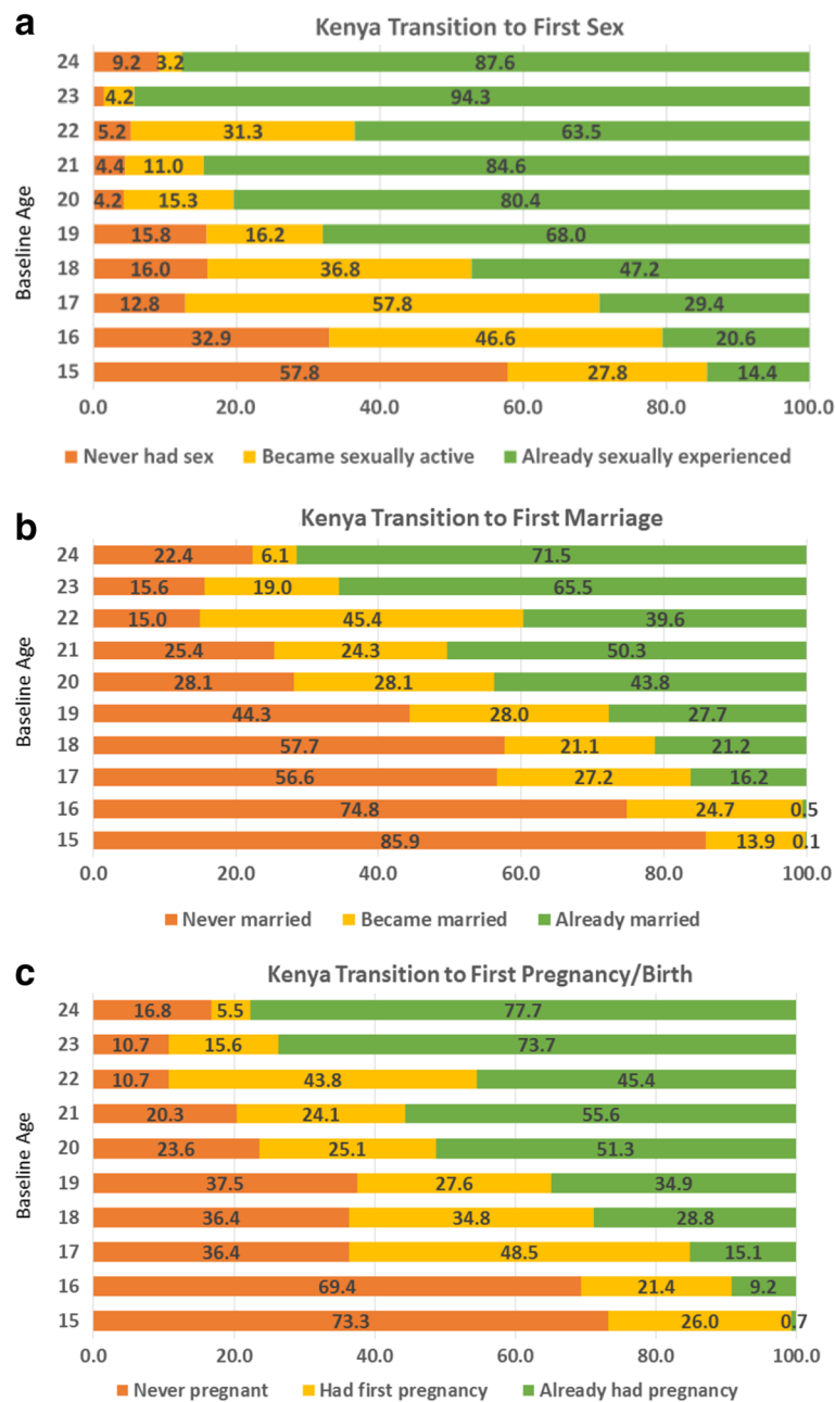
Fig. 1 Kenya transitions between baseline and endline; a transition to first sex; b transition to first marriage; c transition to first pregnancy/birth

squared which are time varying variables in the model, education level, city, religion, whether or not the woman is currently a student at baseline or endline (Kenya only), religiosity (strongly religious versus somewhat religious/not religious), whether she reads newspapers, reads magazines, listens to the radio, watches television, whether she has visited another city in the last 12 months (urban mobility), whether she visited a rural area in the last 12 months (rural mobility), wealth, slum status (Kenya only), and an interaction between age and whether or not she is