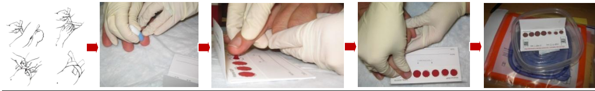
Exhibit 2. Collecting the capillary whole blood.

When seven capillary whole blood spots were successfully collected (or blood droplet formation ceased), FIs wiped off remaining blood with gauze, instructed respondents to firmly apply the gauze to the finger for at least two minutes, and then applied a band aid to it. FIs collecting fewer than five spots less than 80% full from a single prick requested respondents' permission to repeat the capillary whole blood collection procedure on a second finger from the contralateral hand. FIs asked respondents to discard used capillary whole blood collection equipment in their own trash receptacle (except for lancets which were discarded in the biohazard container). FIs discarded them in the biohazard container when interviews were conducted in public locations.