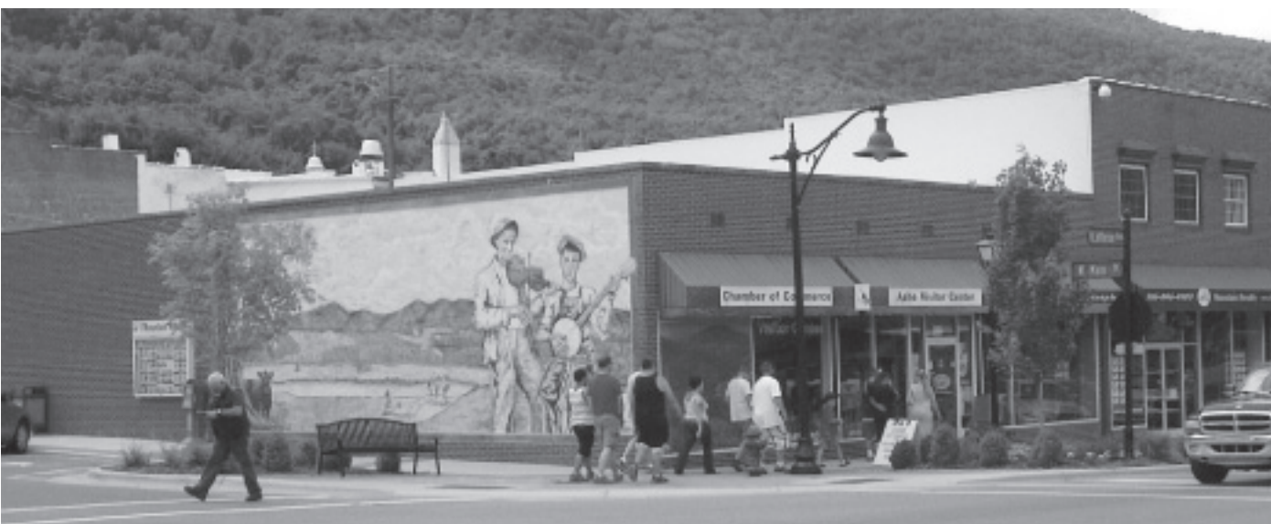
Pedestrians taking advantage of new walkability measures in West Jefferson, NC.

1 "West Jefferson, North Carolina: A Fun Place to Visit. The Herald-Dispatch, Huntington, West Virginia. August 2013