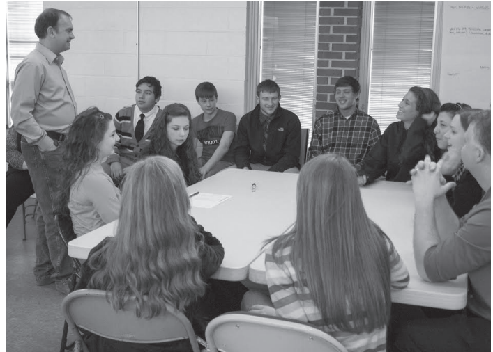
Citizens of Southwestern North Carolina gathered to share ideas at community workshops in every jurisdiction within the Opt-In project area.

their own purposes or they can choose not to do anything.