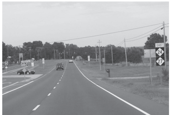
NC 24/27 (Old Red Cross Road) in the early 1900s (top image) and today (bottom image).